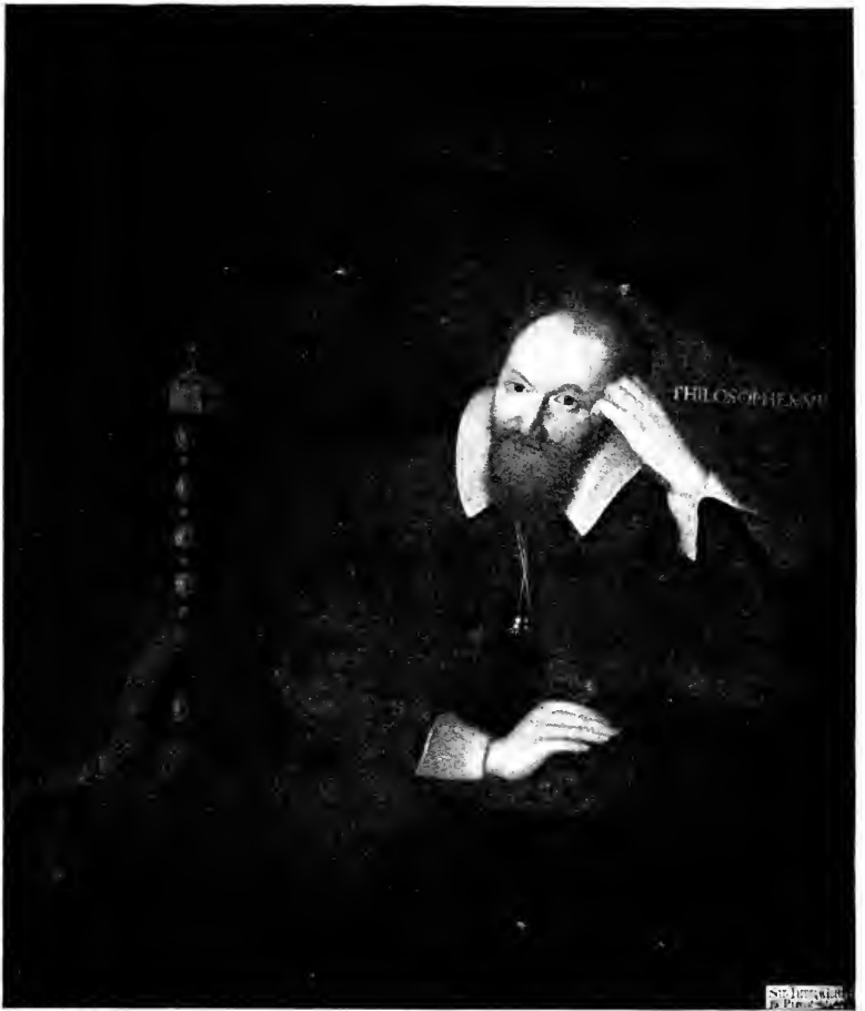
PORTRAIT OF HENRY WOTTON

(From the original at Eton College, by an unknown painter.)