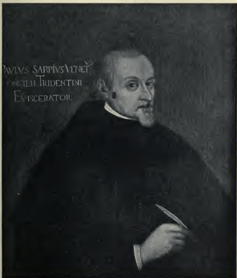
PORTRAIT OF FRA PAOLO SARPI

(From the picture, by an unknown painter, in the Bodleian Library.)