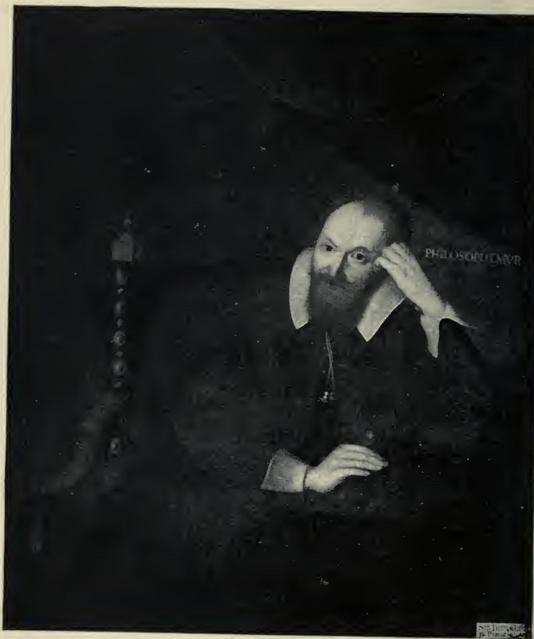
PORTRAIT OF HENRY WOTTON

(From the original at Eton College, by an unknown painter.)