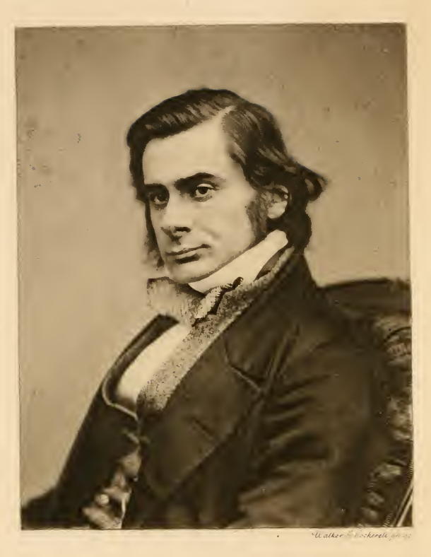
All Mally 1857.