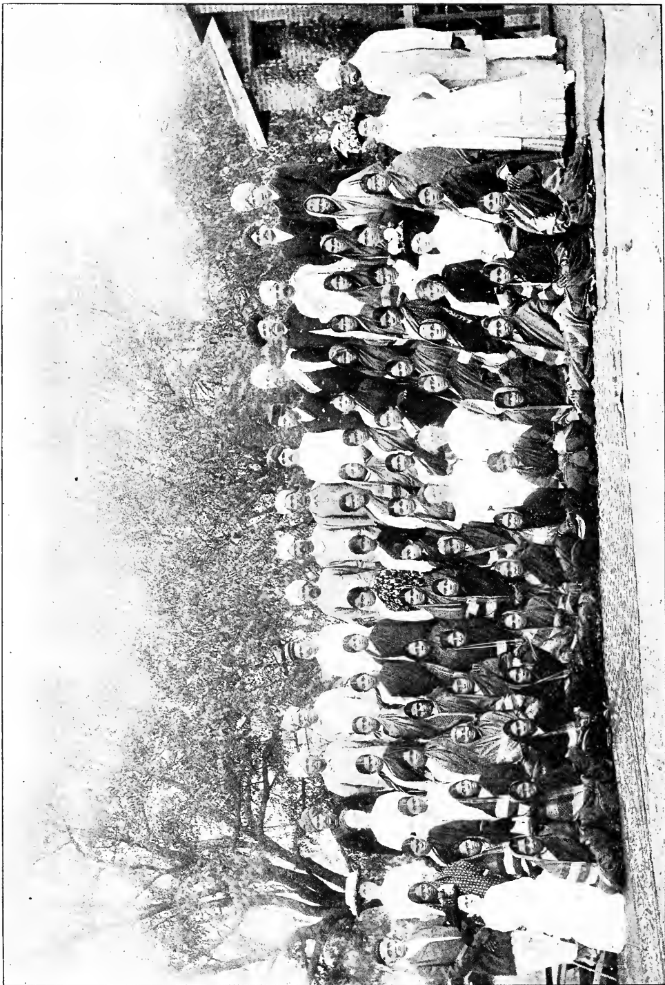
MISSIONARIES AND NATIVE WORKERS IN AHMEDNAGAR. (See page 249.)