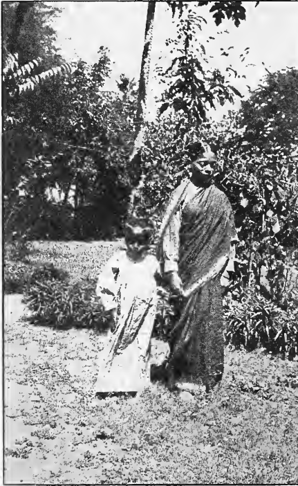
BLIND GIRLS AT BOMBAY