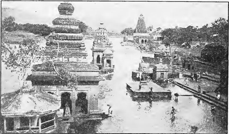
THE TEMPLES AT WAI