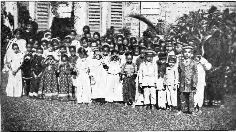
PAREL GIRLS' SCHOOL, BOMBAY

as it appears and especially when the dreaded plague rat is found in a house, the family moves out into the fields and lives in a tent or a rud hut. So it will happen that whole sections of a village will move away and the work in that locality must necessarily be closed. The mute witness which these locked and barred houses bear to the presence of the terrible epidemic is most appealing. Sometimes it will happen that the people of a given section will all move to the same fields and then the school can be opened again, and it is held under a neighboring tree. We visited one such school and were interested to see how much good work could be done under these adverse conditions. A large box provided safe keeping for the books and slates and for the clock which during school hours hung from a branch of the tree, while the blackboard remained as silent witness to the purpose for which the spot was used. The children seemed happy and contented and we wondered if American children would not sometimes enjoy such a change of schoolroom.