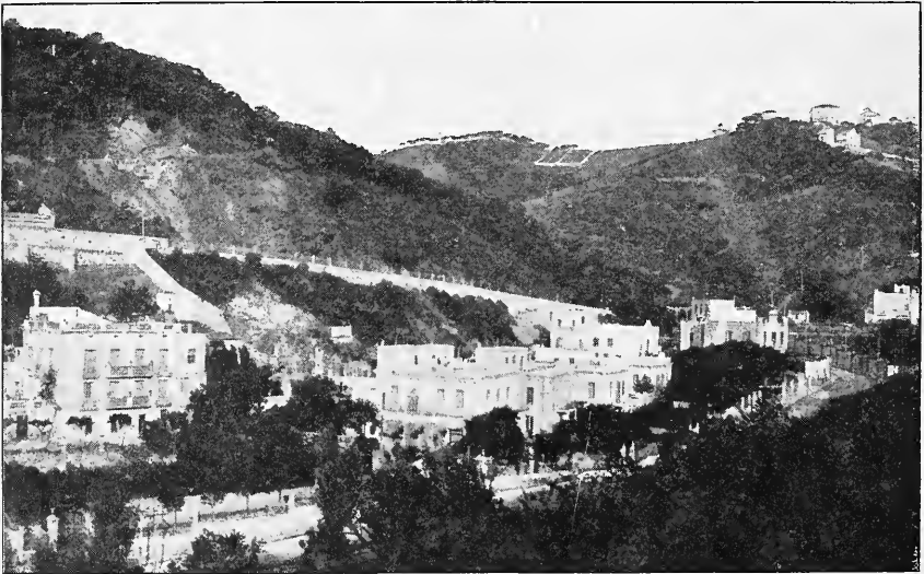
OUR SCHOOL BUILDINGS IN BARCELONA

“I am conducting a preaching service every Sunday, and Sunday is my busiest day. Now don't laugh at my being ‘Pastora,’ because I assure you that I try to do my best, although that best may not amount to much. By and by some member of the little congregation will help me. Sunday afternoon I have charge of the Sunday school, and I have organized a Men's Club, which meets in the schoolroom after the Sunday-school session, and I frequently go there with other friends to read the papers and books to these men, and to talk with them ‘until the evening round the brasero , that they may not be drawn away to the wine shop.’”