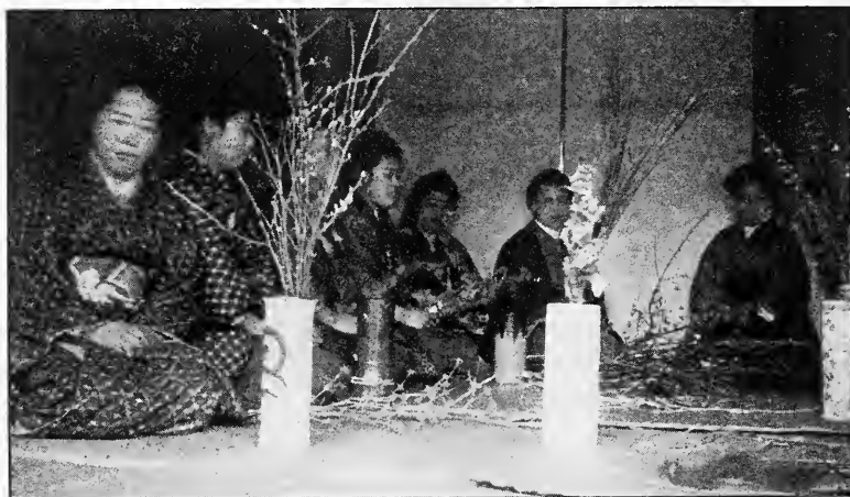
A Lesson in Flower Arrangement