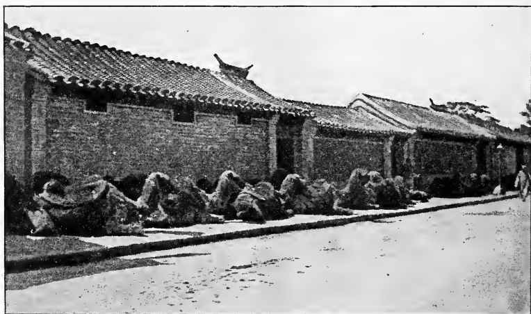
Resting After Their Journey (A Peking Street)

Just beside this court is the wonderful museum, filled with curios brought from the old Imperial Palaces at Jehol. It is hard to give you an idea of this in mere words. Cases and cases are filled with marvelous vases and carvings, and there are many old bronzes, some dating from the time of Christ. The skill and