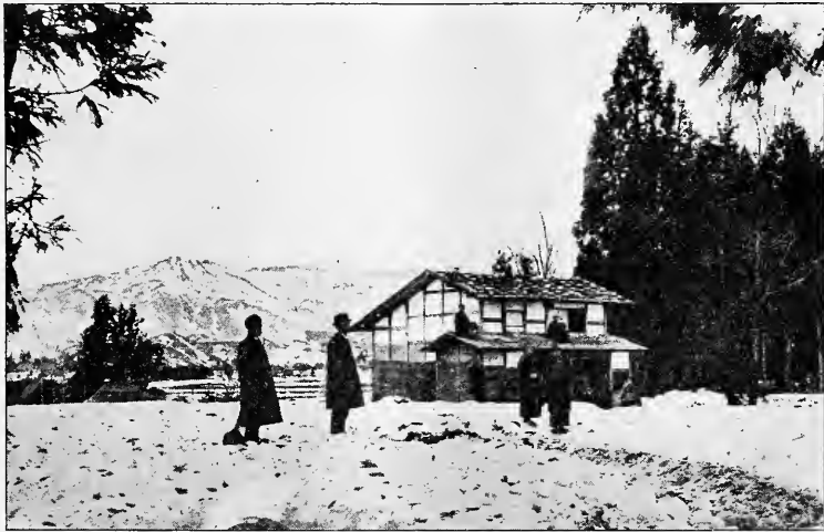
The Church and Parsonage at Sanashi, Niigata Field