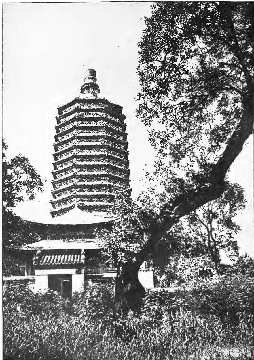
A Deserted Temple in Peking The Thirteen Story Pagoda in Rear (See page 155)