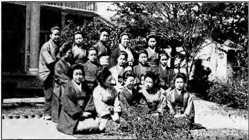
Students at the Kobe Evangelistic School