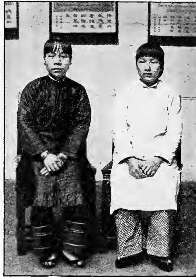
Foochow Hospital Helpers