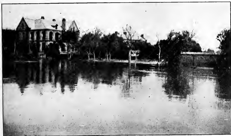
Tientsin Compound in Flood

NOTE.—As no pictures illustrating the conditions in Peking were available, the editor has ventured to use these photographs furnished by Miss Carolyn T. Sewall, showing flood scenes in the Tientsin mission compound.