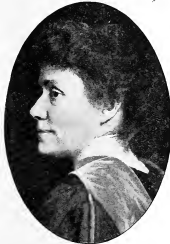
President Mary E. Woolley Mount Holyoke College