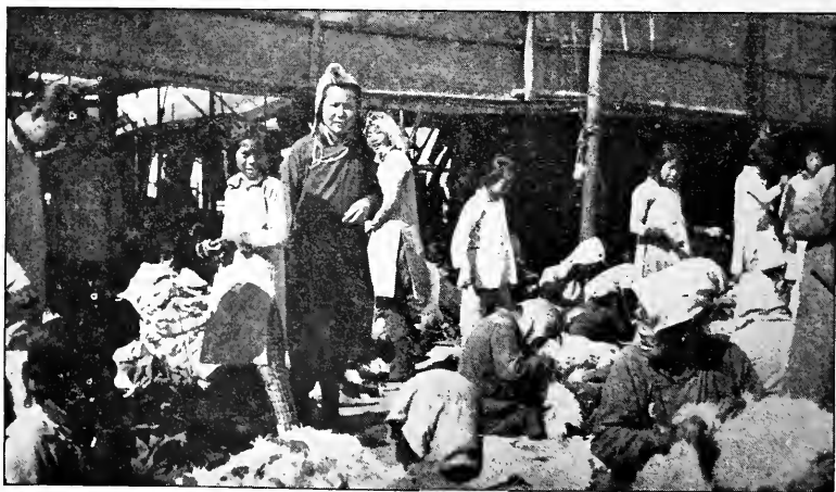
Women Workers in Factory, Peking, making Soldiers' Garments

This was in the middle of July. • Since then, politics have continued on their downward way. The military party are in control,