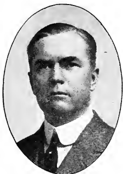
Dr. John R. Mott