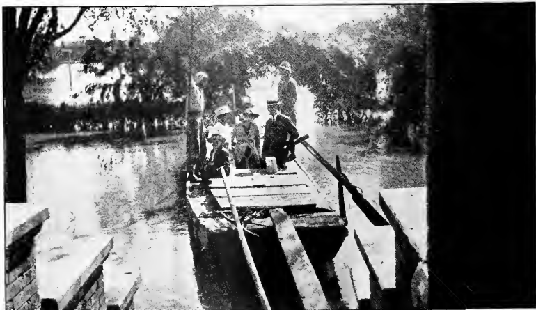
The Tientsin Missionaries Reaching Home During the Flood

The industrial work for women was kept up into the summer, and over twenty women continued to learn much of cleanliness and better ways of work, besides earning a little which should help them in their destitution. Orders for their work have come often from hospitals, and much has been done for individuals. Now the Americans have taken up Red Cross work, and probably will give a good deal of work to these women. We are thankful for that prospect, for so we can relieve a little of the great amount of suffering from poverty among us. That suffering is going to be terribly increased this winter by the floods caused by the great rains of the last month. The rainfall has been very excessive, and in great regions south of Peking and Paotingfu rivers have burst their banks and joined with the rain in destroying crops and villages. Hundreds of villages have been flooded, many destroyed, and great regions still stand under water. The suffering among the villagers is already very great, and the loss of crops means great destitution this winter. It is hard to see where sufficient help can come from, for many for-