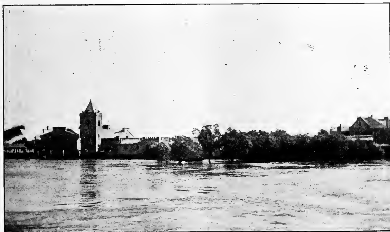
Flood Scene in Tientsin Church and Missionary Residence

In June came the closing of other schools, and commencements followed each other thick and fast. A class of fine young women graduated from the Women's College. We know that we may rejoice in the future in the work that they will do. We were proud that three of our own girls graduated from the Women's Medical