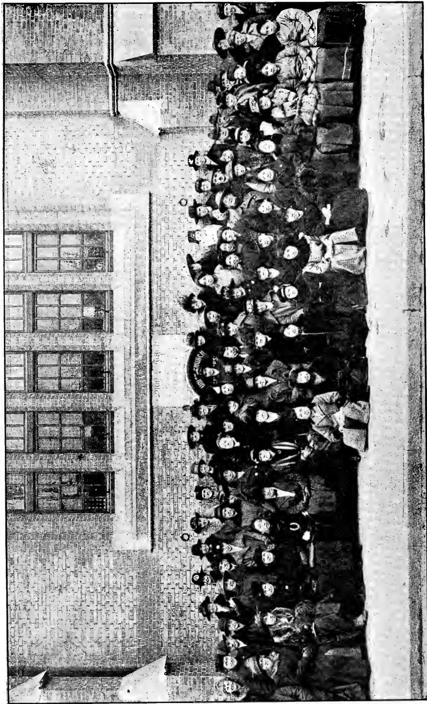
A GROUP OF THOSE IN ATTENDANCE AT THE SHANGHAI CONFERENCE. See page 163.