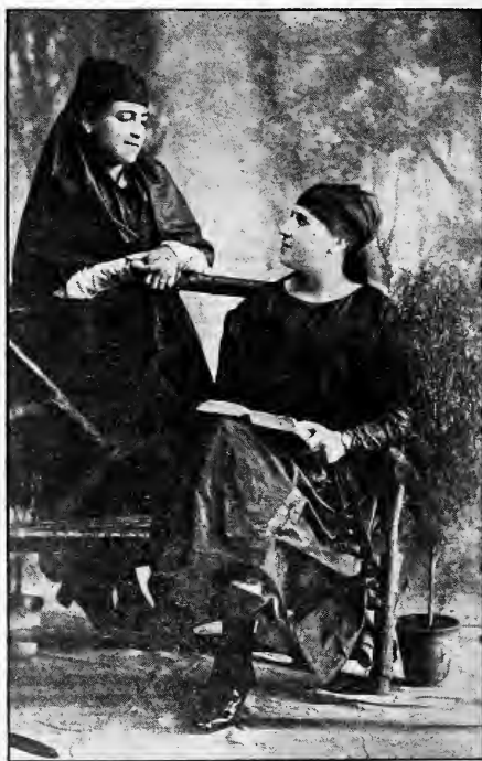
Mohamedan Students at Gedik Pasha