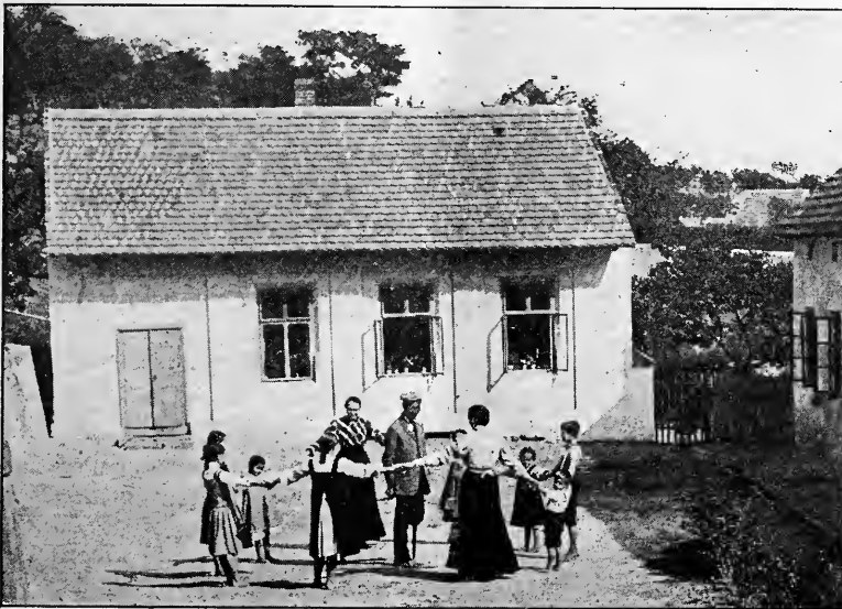
The Chvaly Orphans at Play

Also the number of feeble-minded children has increased among us and this although we desire to take only the mentally sound. Even when children come with the recommendation of a good physician, it sometimes happens that later mental defects reveal themselves, and we have observed that there is a very deleterious influence over younger children mentally sound when placed with