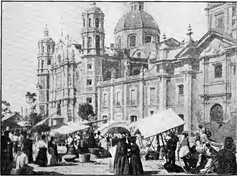
The Moving Picture in the Plaza

Saturday evening we sat out on the sidewalk (there are no front yards in Mexico), in front of the mission house, and watched the Carnival celebrations going on in the plaza . It was an amazingly picturesque scene, looking like the stage setting for some performance and it made one wonder whether it would be grand opera, comic opera, or a moving picture. The mob was there in full,—shifting figures of men in their loose, white cotton trousers, huge straw sombreros almost hiding their faces, and all draped in brilliantly colored sarapes (blankets); a few women hurrying