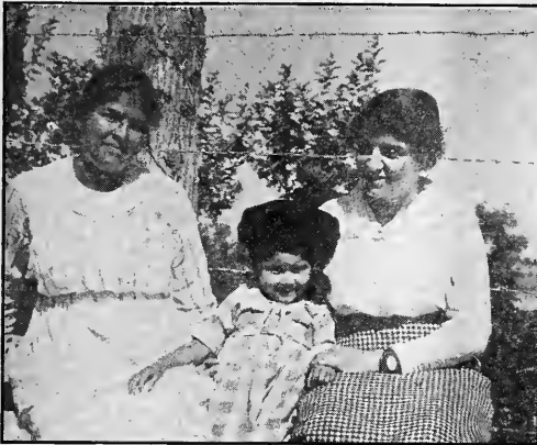
A Mexican Christian Teacher with a New Missionary

the church, the young people took part, and it was inspiring to think that there was a group of young people thinking about and praying for the evangelization of the world. Rather different from the groups in the plaza the previous night! At the evening service the choir sang as a special song, "Be a hero," and four young people were received into the church. You can't tell me that leaven like that will not eventually do its work leavening the whole lump, even though we may not live to see the day when the whole lump is leavened. You can't tell me that missions don't