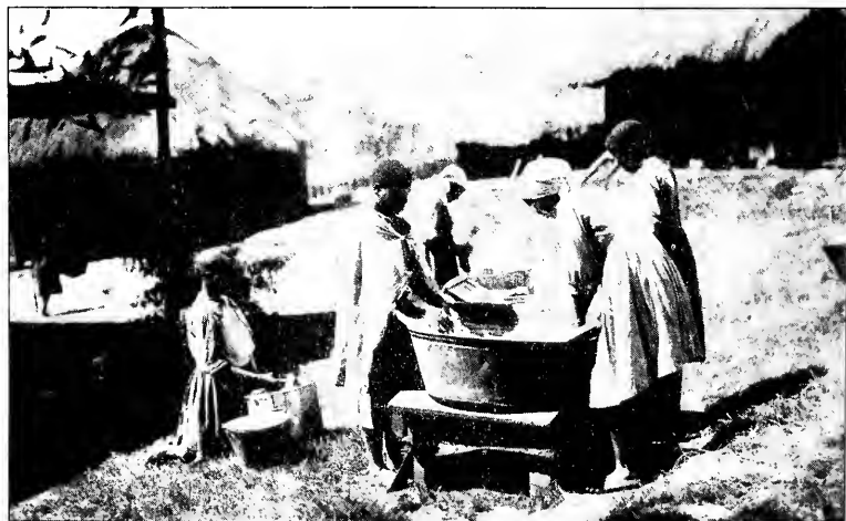
LAUNDRY BRIGADE AT MT. SILINDA, EAST AFRICA.