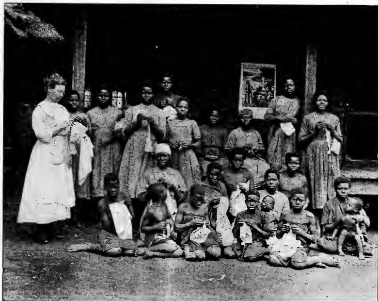
Sewing Class at Gogoyo.