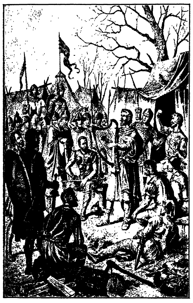
Alfred in the Danish camp.—Page 101. Alfred the Great.