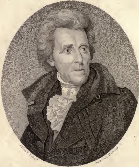
GEN. ANDREW JACKSON.