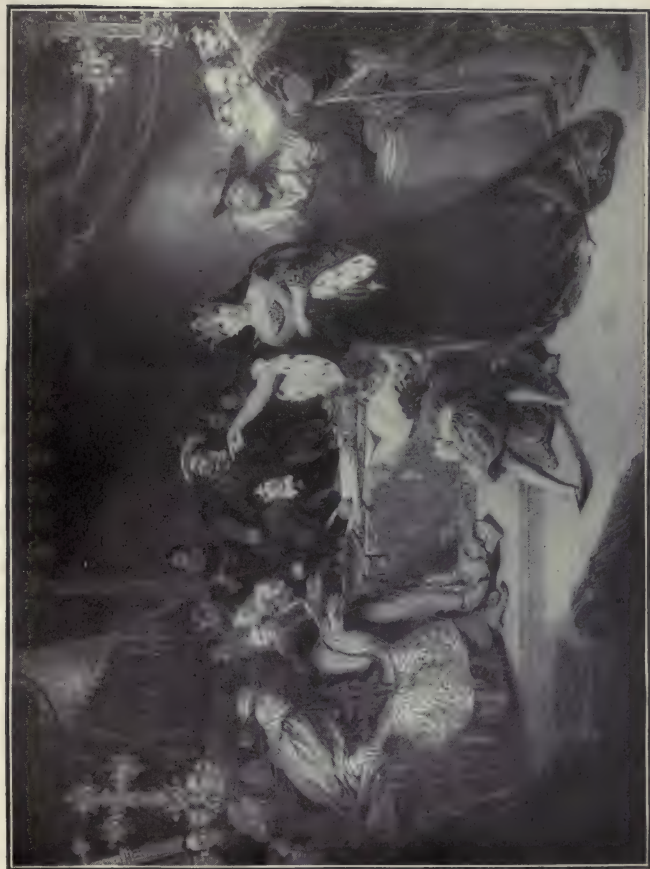
The trial of Katharine at Blackfriars.—Page 208.