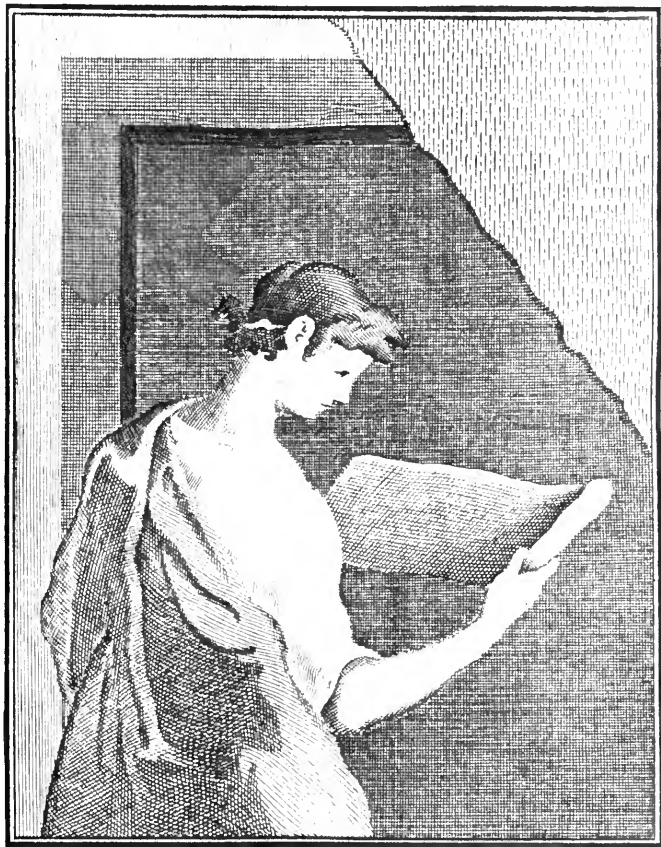
Halsted VanderPoel Campanian Collection