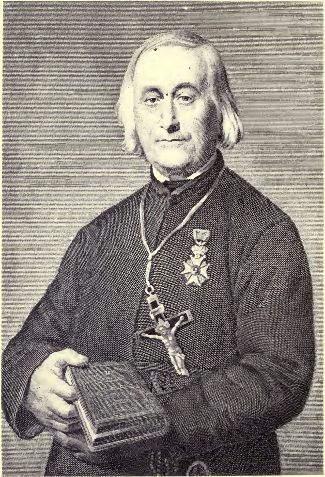
P. J. De Smet S.J.