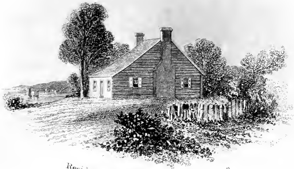
Residence of the Washington Family *