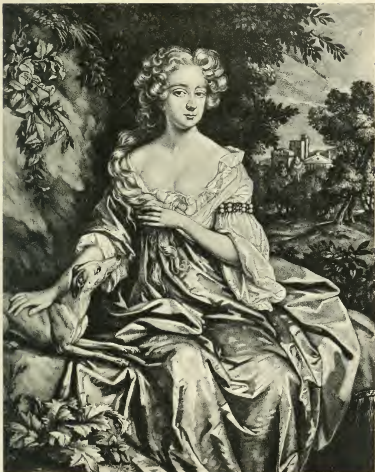
THE COUNTESS OF OSSORY.