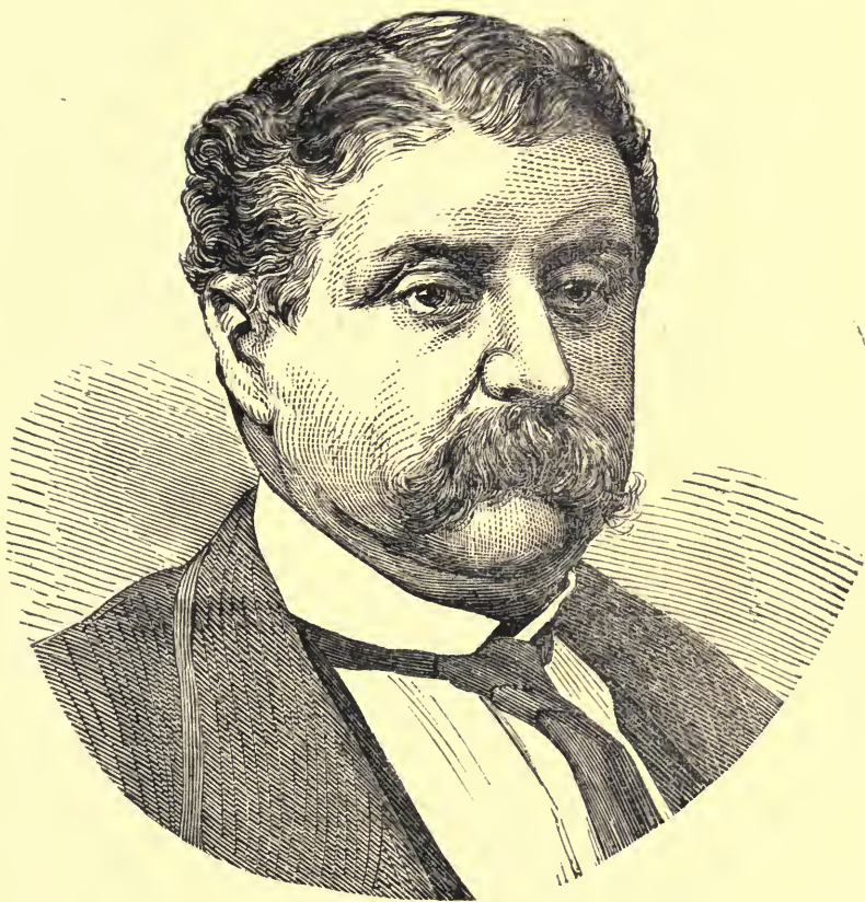
JAMES FISK, Jr.