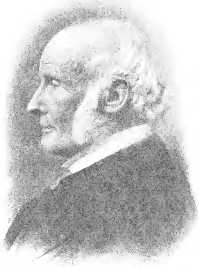
From a photograph taken in 1892