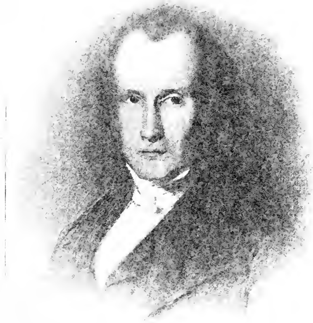
From a portrait painted in 1847