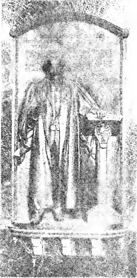
From the Alto-Rilievo by St. Gaudens in the Marquand Chapel, presented in 1889 by the Class of 1879