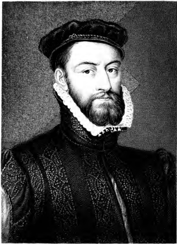
JAMES STUART, EARL OF MURRAY.