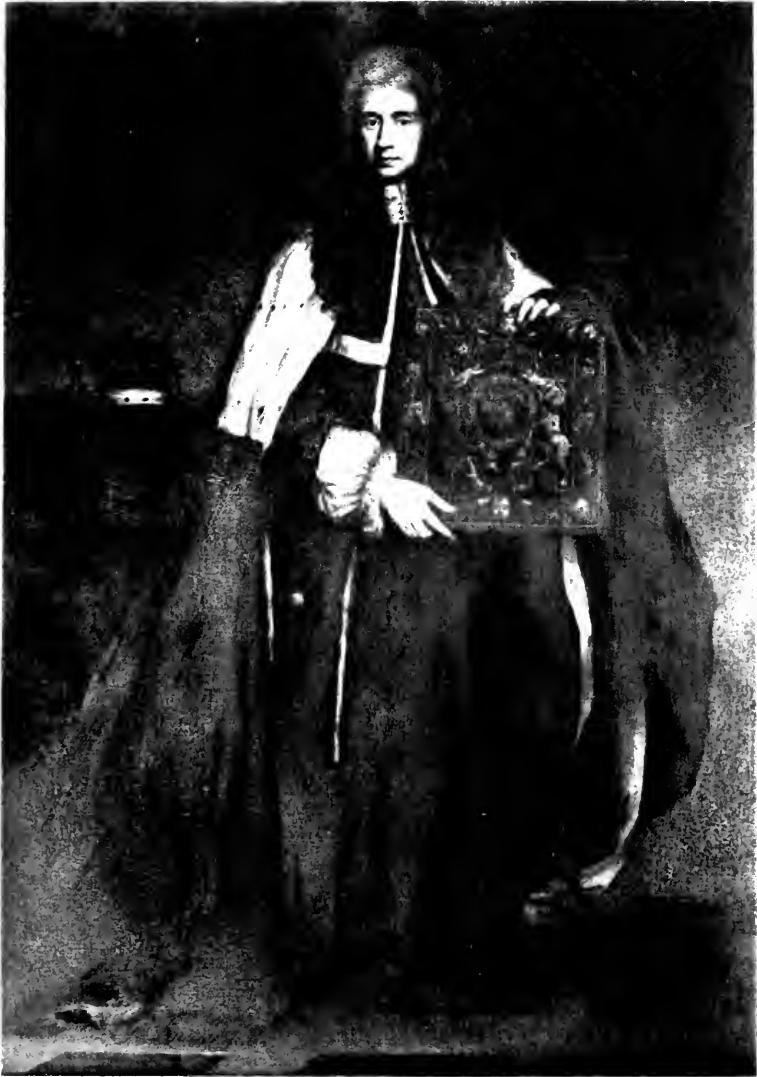
Jeffrey as Lord Chancellor after a Painting in the possession of the Earl of Tankerville