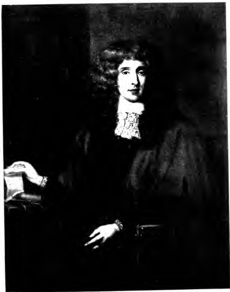
Jeffrey as Recorder of London. aetat. 30. after the painting by Kneller in the National Portrait Gallery