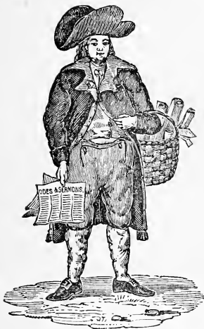
JONATHAN PLUMMER, POET LAUREATE TO LORD DEXTER.