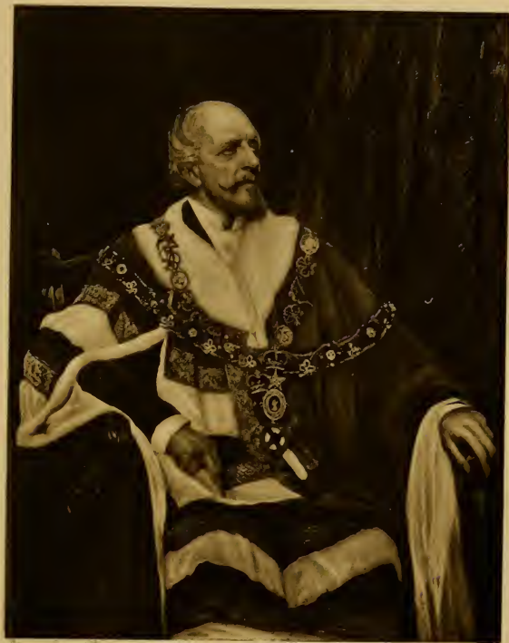
The Marquis of Dufferin (circa 1894)