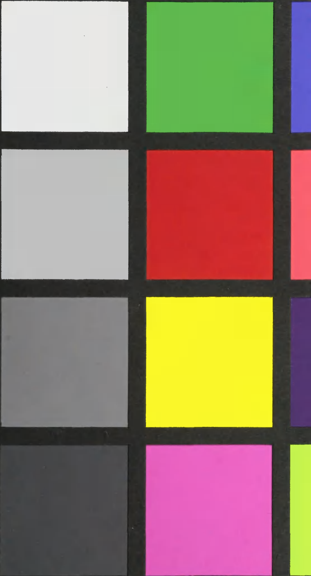
GretagMachbeth™ ColorChecker Color Rendition Chart