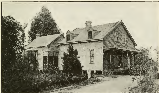
A view of "Sunnyside," the Australian home of Mrs. White at Cooranbong, New South Wales, 1895-1900.

Mrs. White's unbounded enthusiasm regarding the improvement of the Avondale estate, did much to cheer and encourage others. She was particularly insistent that no time be lost by the school men in the planting of an orchard; and she greatly rejoiced when in October one thousand choice fruit trees were