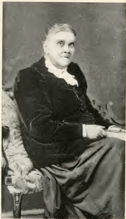
Sydney, Australia, 1899