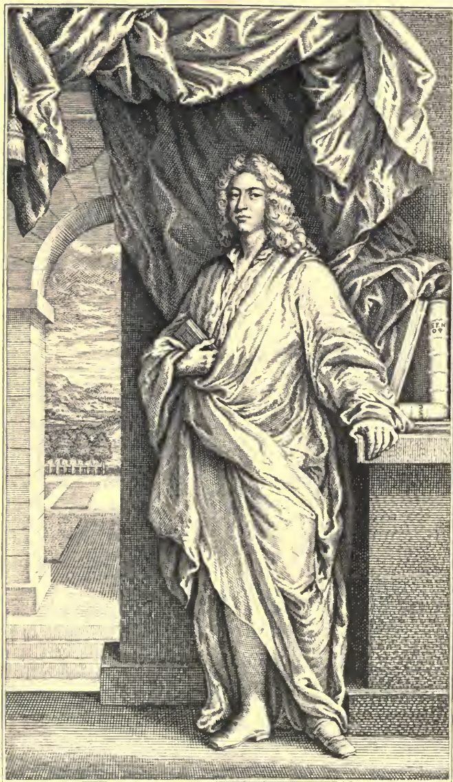
The Right Honorable Anthony Ashley Cooper Earl of Shaftesbury, Baron Ashley of Windsor, St. Giles, & Lord Cooper of Parliott.