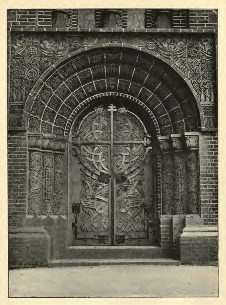
MORTUARY CHAPEL: PORCH AND DOOR.