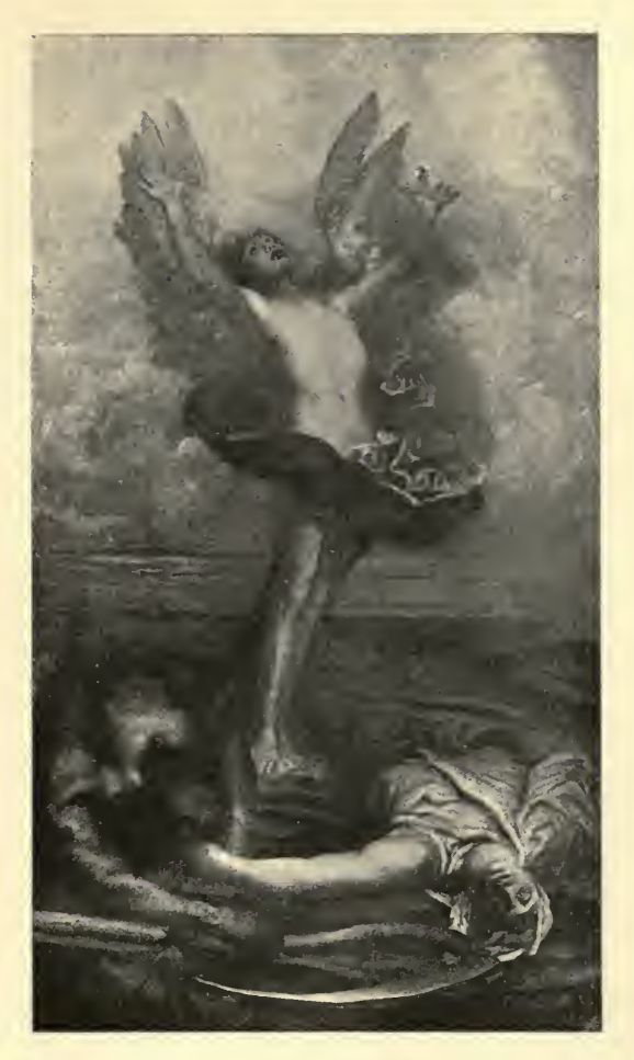
LOVE TRIUMPHANT.