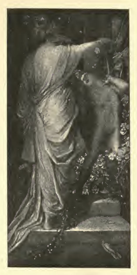
LOVE AND DEATH.