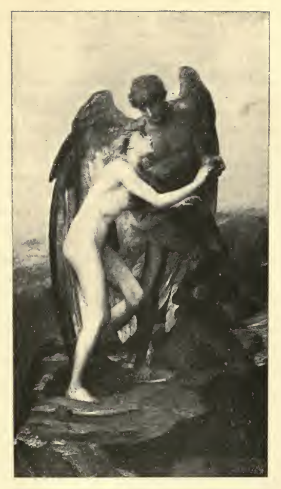
LOVE AND LIFE.