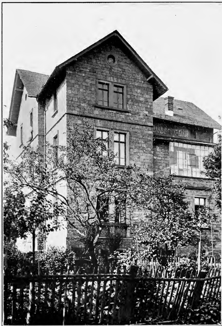
STRUBBERG'S RESIDENCE IN GELNHAUSEN