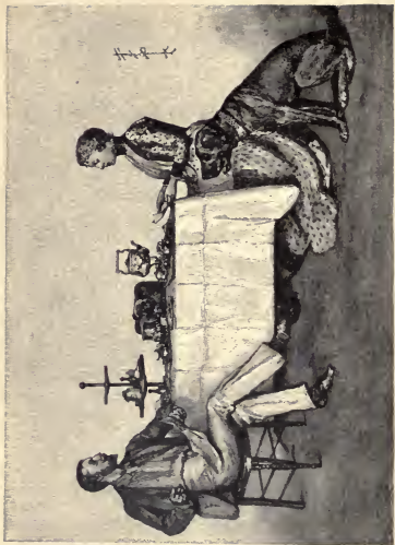
“THE MOST EXCITING PART.”