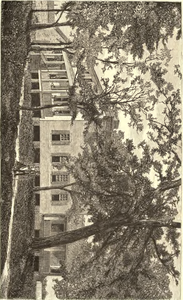
LIBERTY HALL, THE RESIDENCE OF MR. STEPHENS.