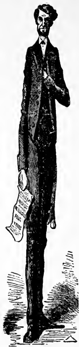
Long Abraham Lincoln a little longer."— From Harper's Weekly , November 26, 1864.