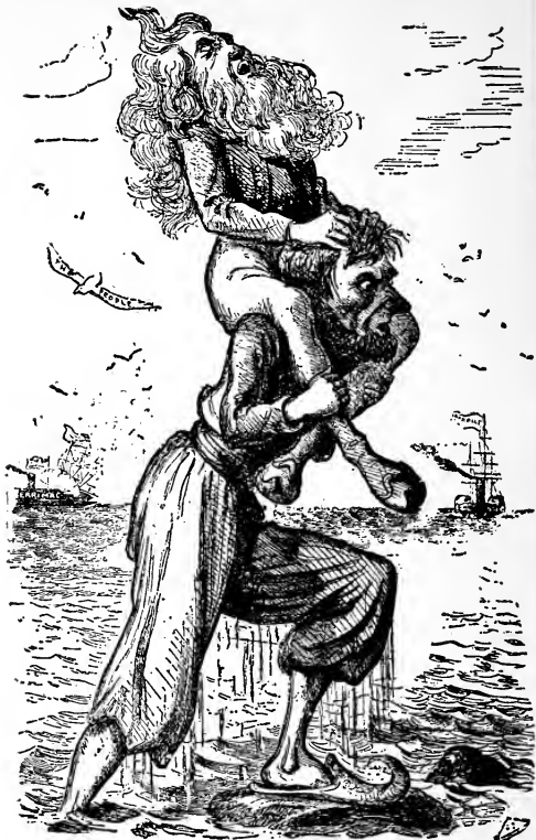
"Sinbad Lincoln and the old man of the sea, Secretary of the Navy Welles."—From Frank Leslie's Illustrated Newspaper . May 3, 1862