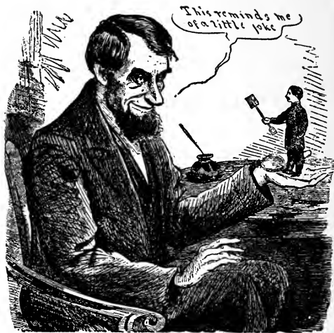
From Harper's Weekly , September, 17, 1864.