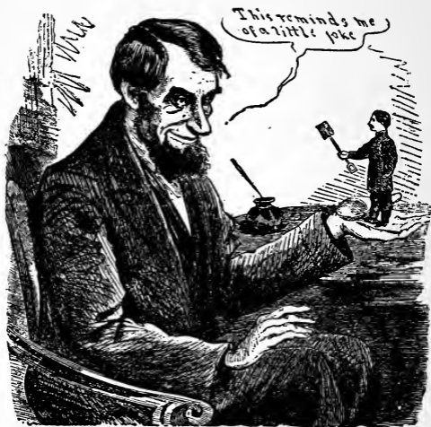
From Harpers Weekly , September, 17, 1864.