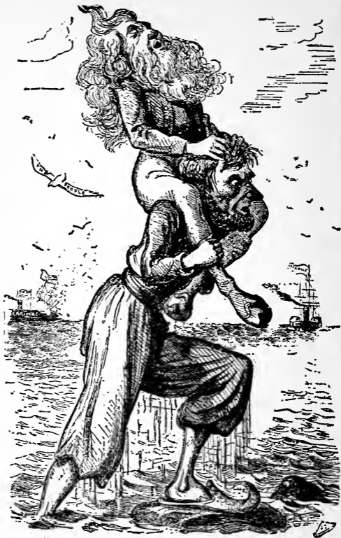
"Sinbad Lincoln and the old man of the sea, Secretary of the Navy Welles."—From Frank Leslie's Illustrated Newspaper . May 3, 1862