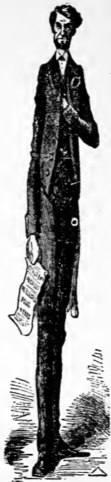
Long Abraham Lincoln a little longer."— From Harper's Weekly , November 26, 1864.