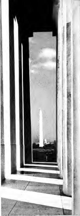
Washington Monument and Capitol from south colonnade of Lincoln Memorial.

The outstanding feature of the Memorial is the statue of Abraham Lincoln (cover) designed and modeled by Daniel Chester French. It is placed in the central hall of the Memorial where, by virtue of its imposing position in the place of honor, it predominates. The statue represents Lincoln