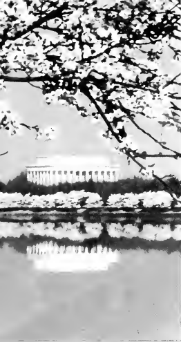
The Memorial through the flowering cherry trees bordering the Tidal Basin.

as the war President seated in a great armchair 12½ feet high, over the back of which a flag has been draped. The gentleness, power, and determination of the man have been wonderfully expressed by the sculptor, not only in the face but in the hands which grip the arms of the massive chair. Twenty-eight large blocks of Georgia white marble compose the statue, which is 19 feet high from head to foot. The extreme width, including the drapery over the chair, is 19 feet.