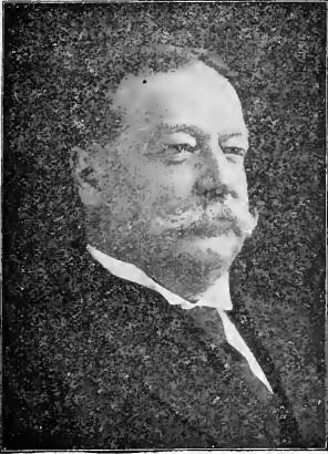
PRESIDENT TAFT WHOSE LETTER AND PICTURE ARE SENT AMONG THE SUPPLIES

The Anti-Saloon League will conduct the correspondence, will furnish the "Scissors Services", Programs, and Pledges, the Taft letter and picture, the Colortype Picture (to the first 5,000 Sunday Schools) and the Lincoln Legion Roll Card to all, and will provide a place and method of permanent national enrollment at Westerville, Ohio, all free of charge.