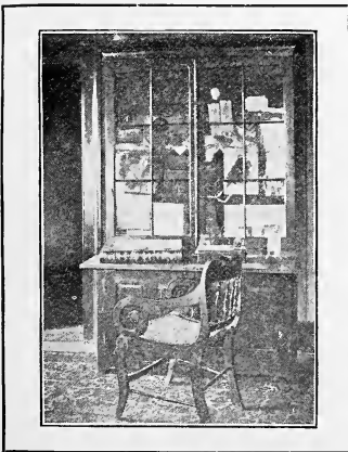
LINCOLN'S DESK AND CHAIR UPON THIS DESK HE PROBABLY WROTE THE LINCOLN PLEDGE