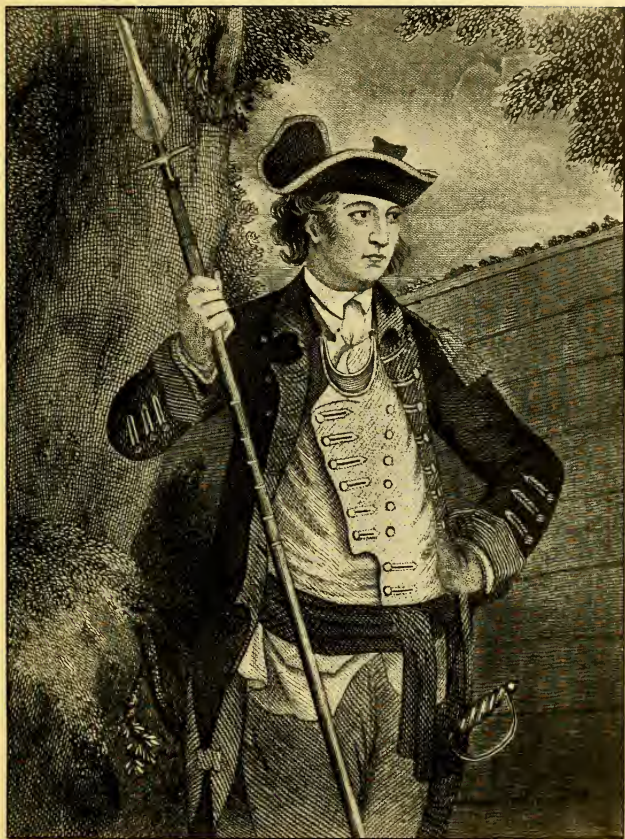
MAJOR GENERAL JOHN SULLIVAN.