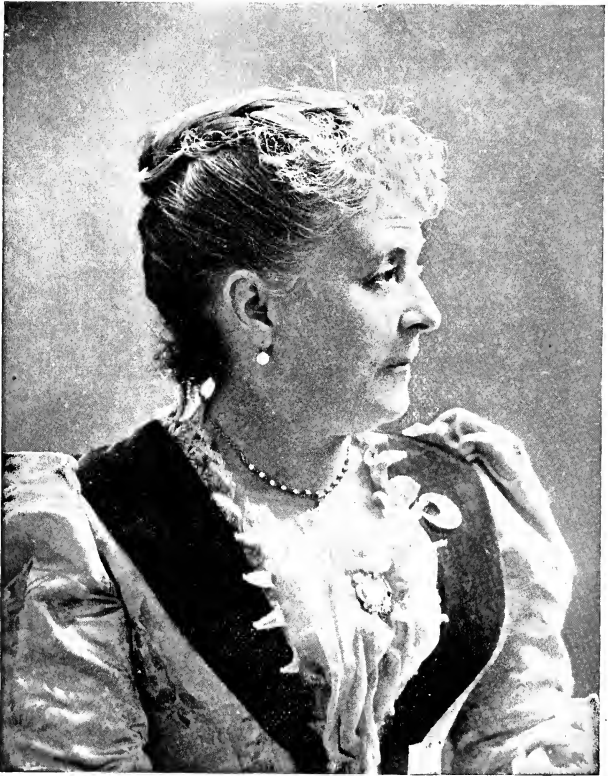
MRS. BENJAMIN HARRISON, President General.