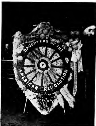
Flower piece sent by the Daughters of the American Revolution on the occasion of the funeral of Mrs. Harrison.