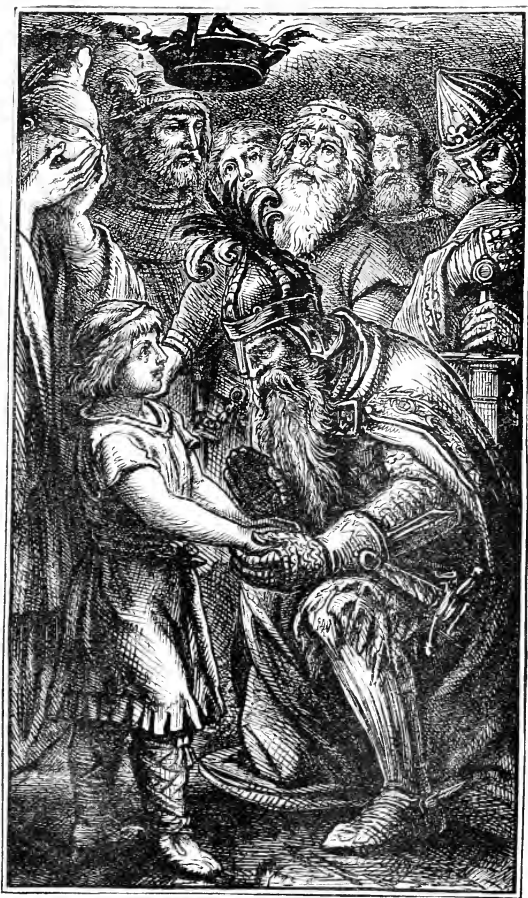
THE OATH OF THE VASSALS.