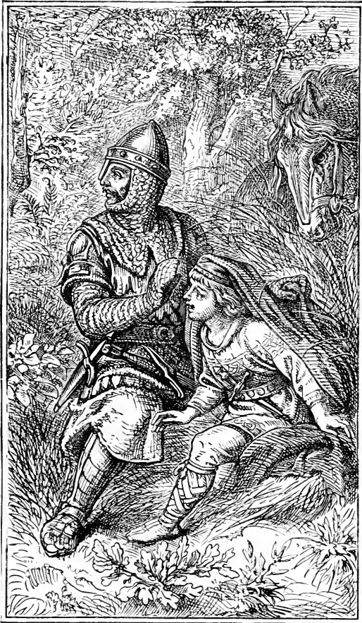
ESCAPE FROM CAPTIVITY.