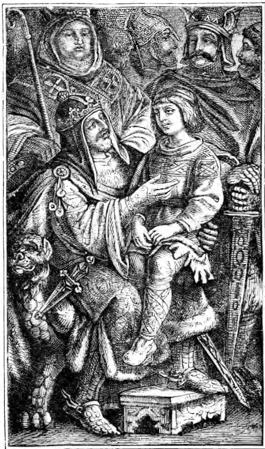
LOUIS OF FRANCE AND THE LITTLE DUKE.