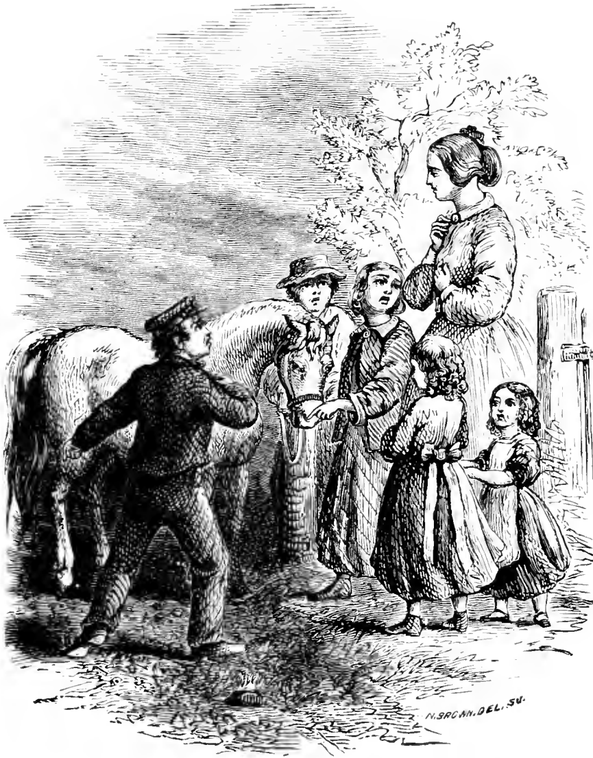
BOTH SIDES OF A STORY. — Page 94.