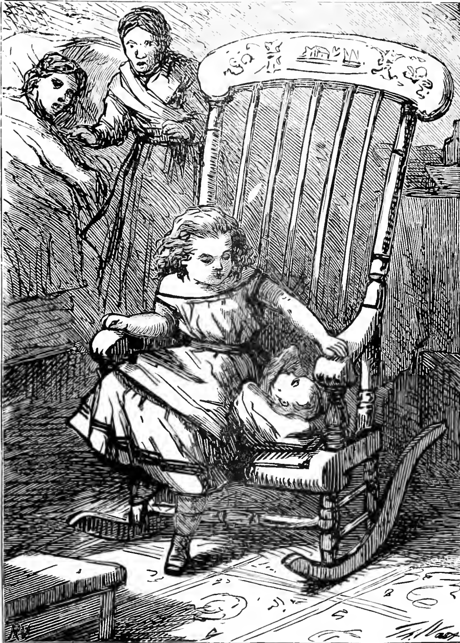
PRUDY SITS ON THE BABY. — Page 16.