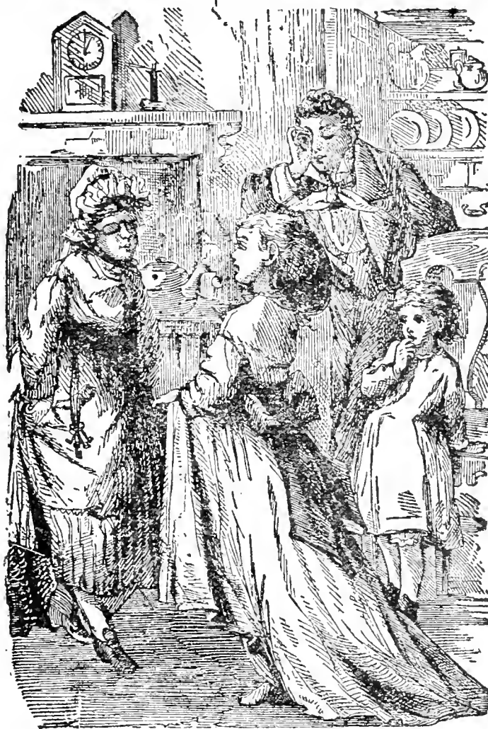
PRUDY KEEPING HOUSE.

"'Oh, what a fascinating creature,' said the Man in the Moon, making an eye-glass with his thumb and fore-finger, and gazing at the lady boarder. 'Are you a widow, mem?'"