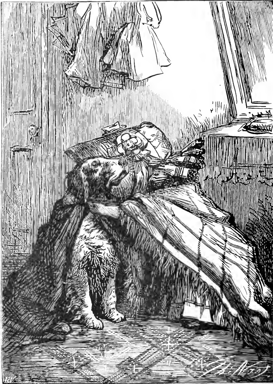
DOTTY DRESSING FOR A PARTY.— Page 62.