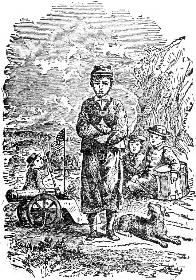
LITTLE PRUDY'S CAPTAIN HORACE.

"You wide-awake little boys, who make whistles of willow, and go fishing and training,—Horace is very much like you, I suppose. He is by no means perfect, but he is brave and kind, and scorns a lie. I hope you and he will shake hands and be friends."