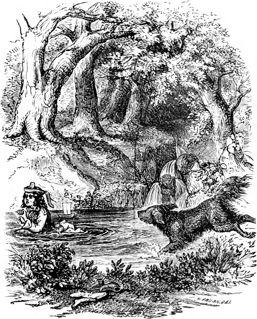
BROTHER ZIP. — Page 132.