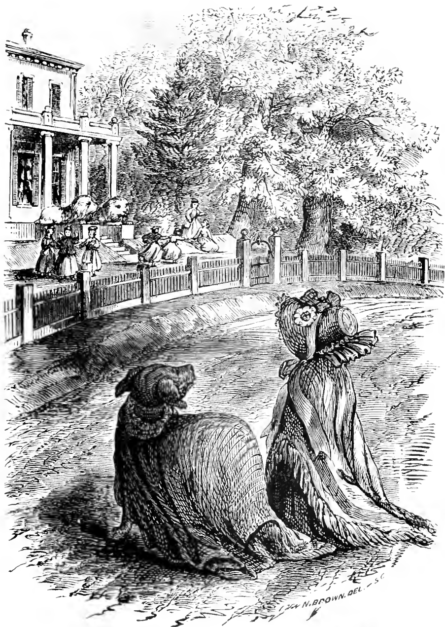
FANNY HARLOW'S PARTY. — Page 68.