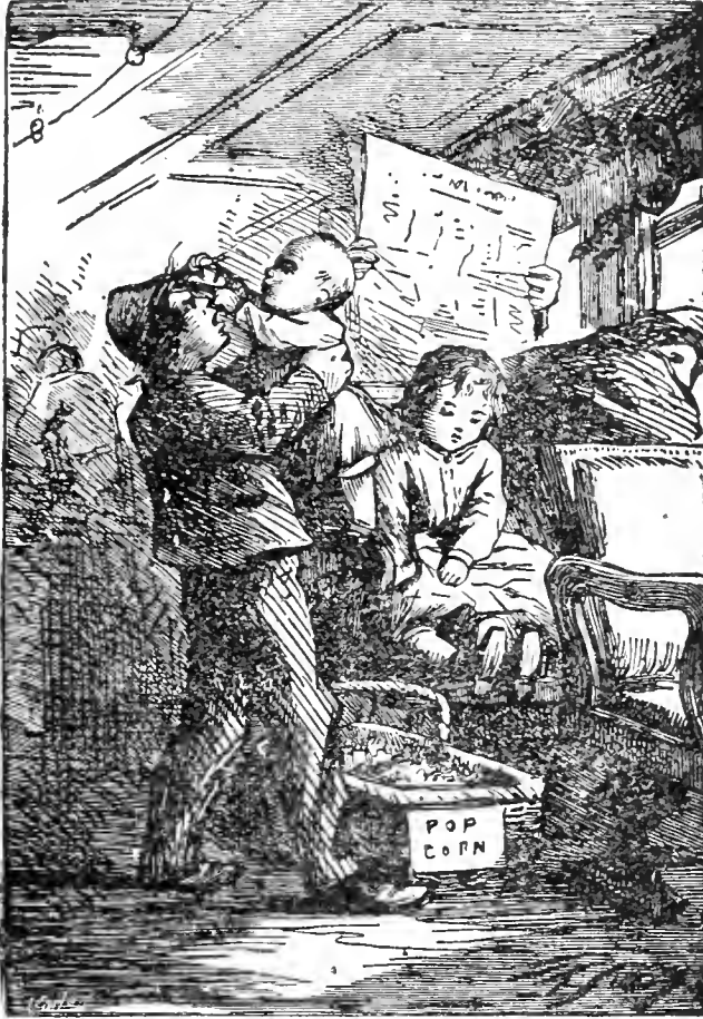
DOTTY GOING WEST

"'Please stop,' said Dotty faintly, and the boy came to her, elbowing. 'I want some of that pop-corn so much! I could buy it if you'd hold this baby till I put my hand in my pocket.' The youth laughed, but for the sake of 'making a trade' set down his basket and took the 'enfant terrible.' There was an instant attack upon his hair, which was so long and straggling as to prove an easy prey to the enemy."