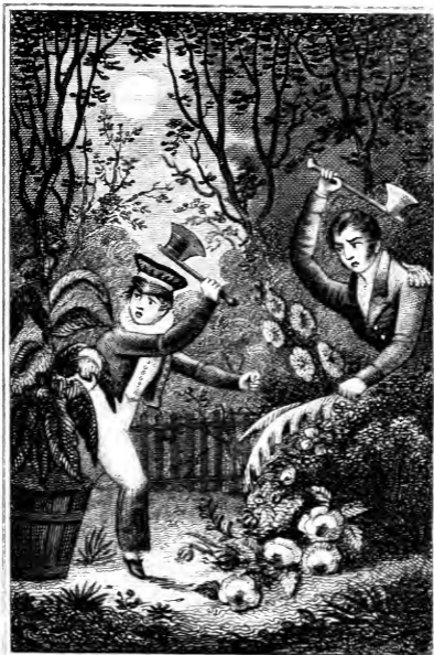
George and the Groom destroying the little Quaker's garden at midnight.