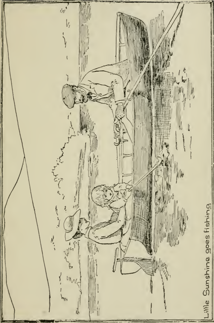
Little Sunshine goes fishing