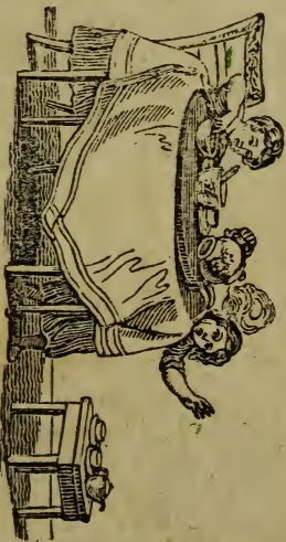
A LITTLE GIRL SCALDED AT THE TEA-TABLE.