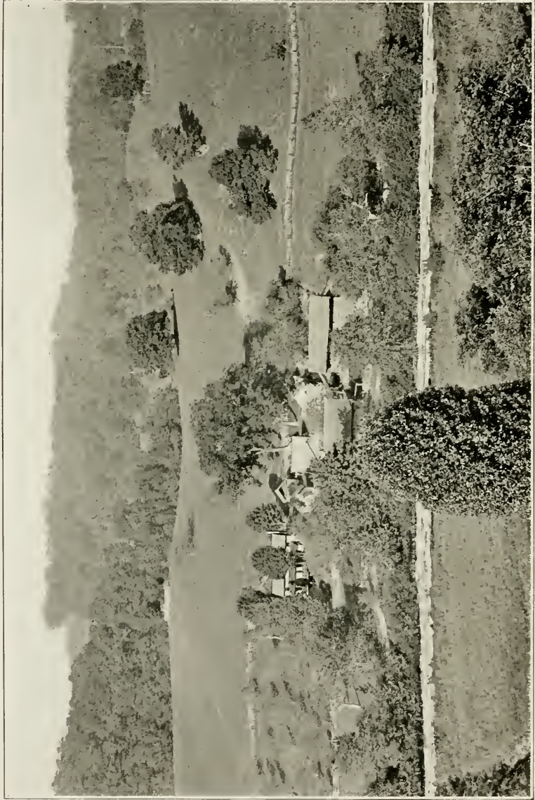
THE HOME, BERLIN