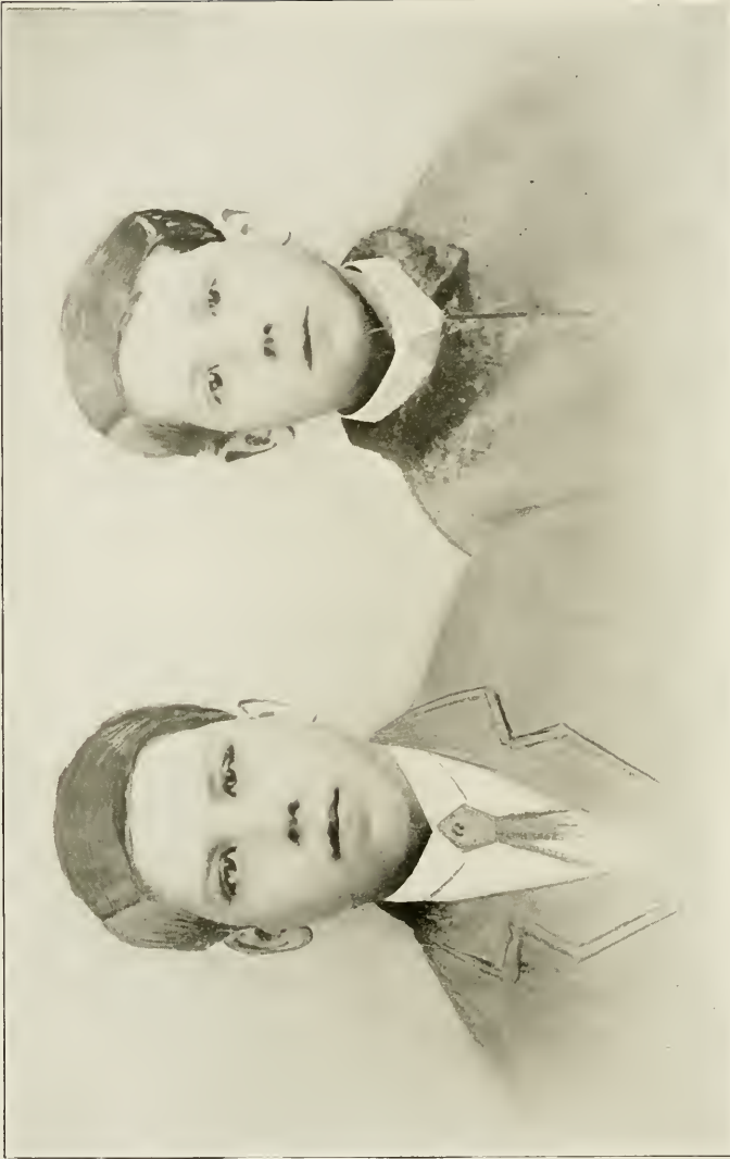
THE BROTHERS (In Youth)