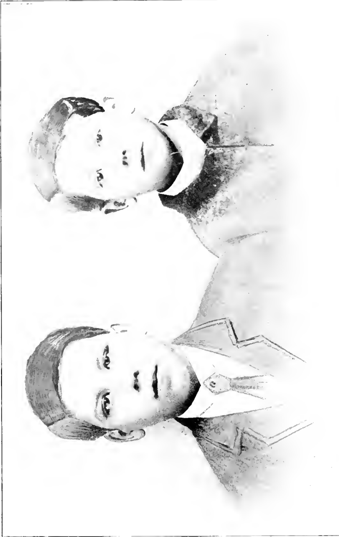
THE BROTHERS (In Youth)