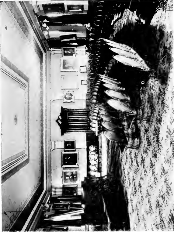
DIALECTIC SOCIETY HALL