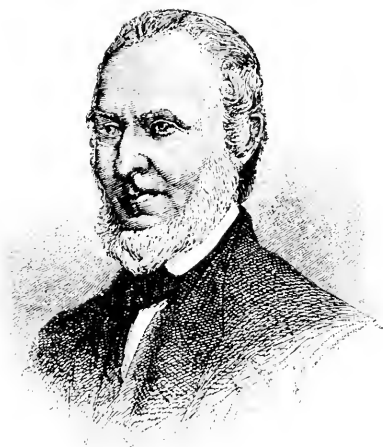
J. G. WHITTIER