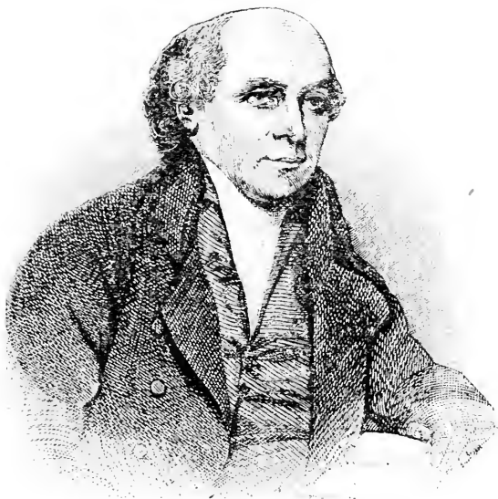
WILLIAM PRYNNE, I. J.