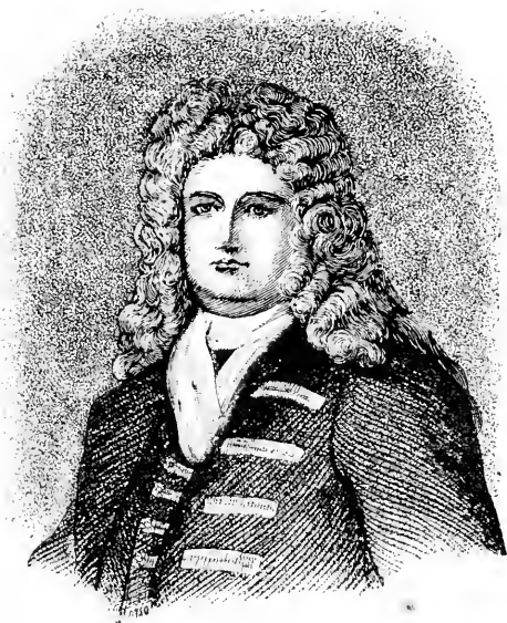
SIR CLOUDESLEY SHOVEL