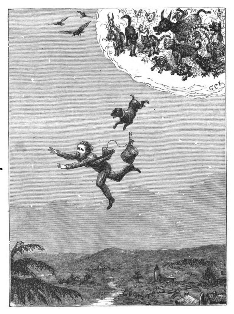
BENJY IN BEASTLAND.