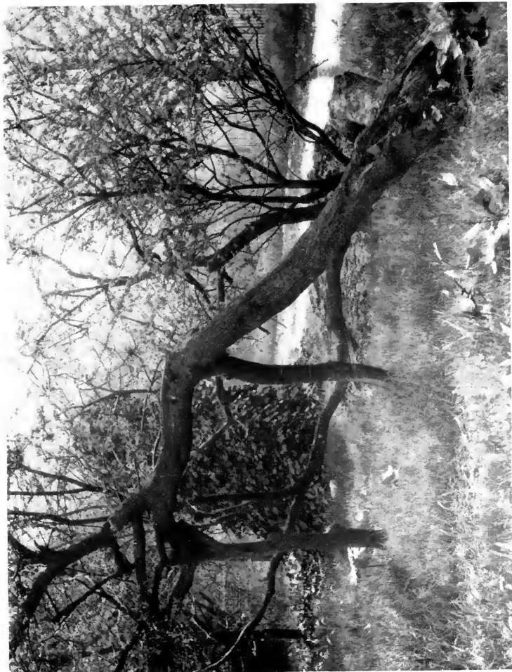
Glastonbury Thorn, Clissold Park