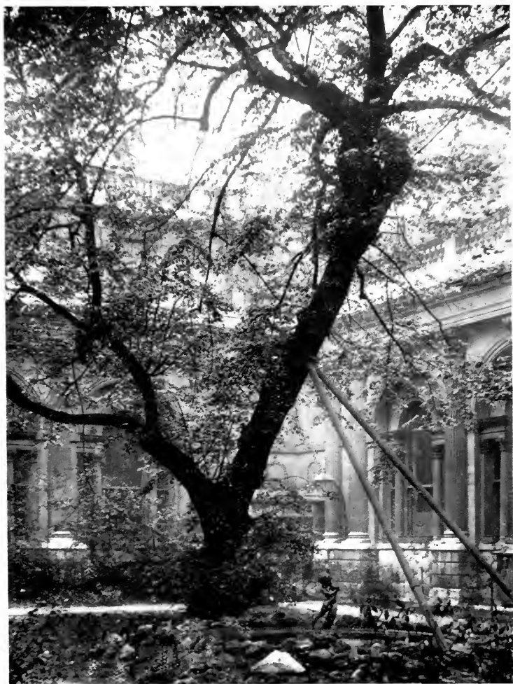
Lime Tree in Court at Bank of England