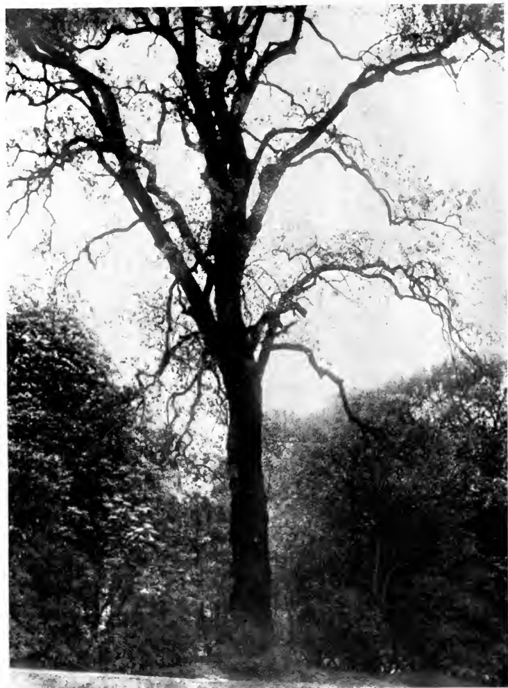
Tulip Tree at Golder's Green