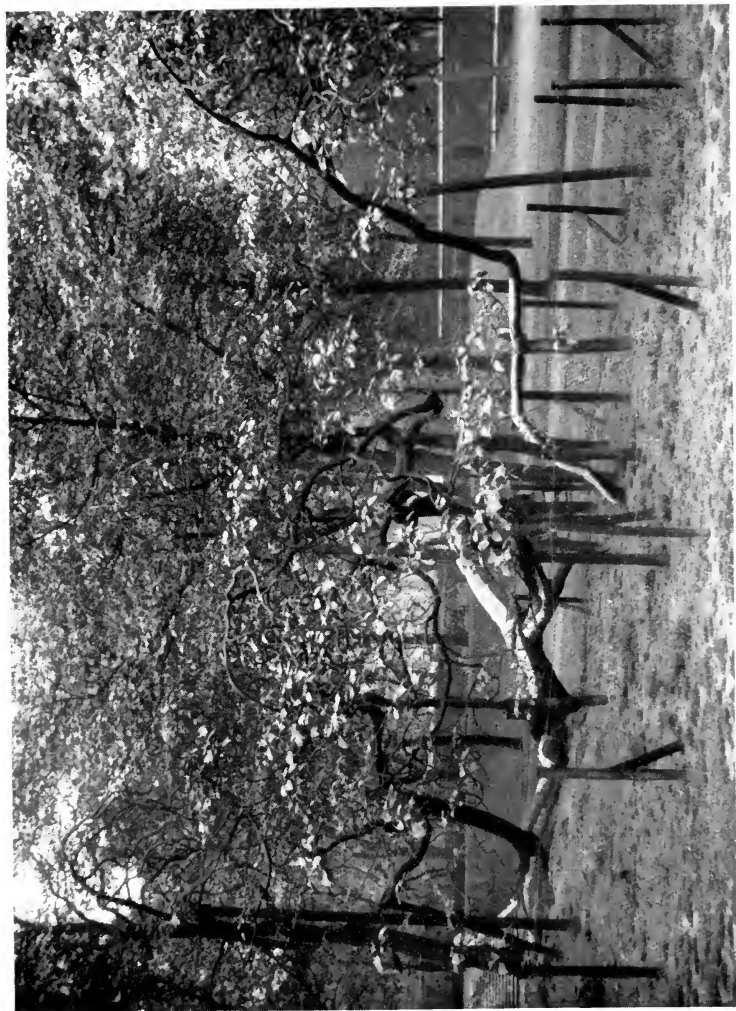
Bacon's Catalpa at Gray's Inn