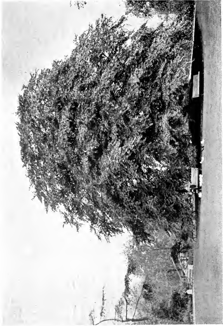
Beech at Grove House, Regent's Park