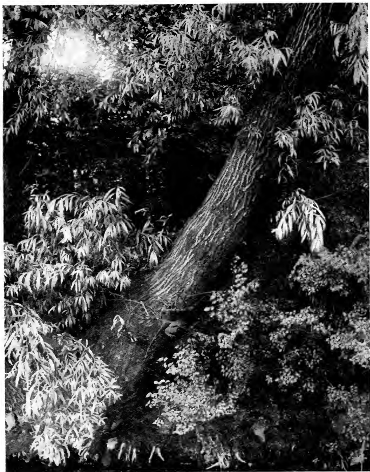
Willow, White or Huntington