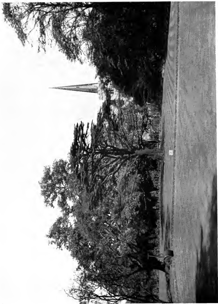
Lebanon Cedar, Clissold Park