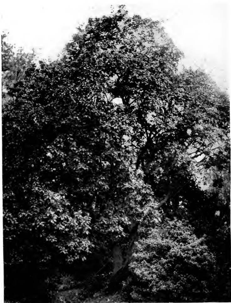
Arbutus in Battersea Park