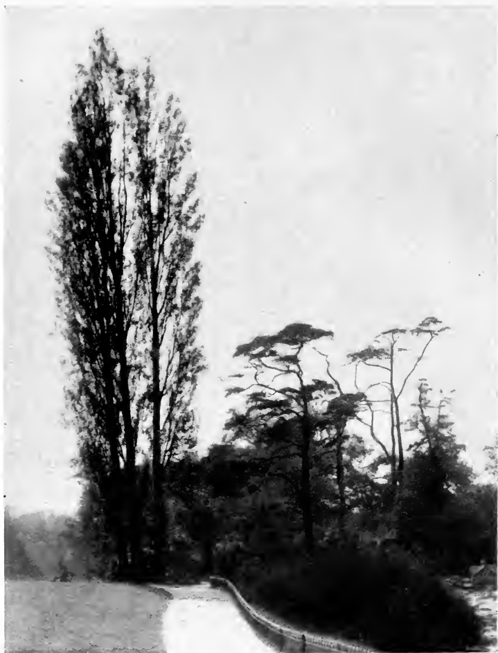
Lombardy Poplars at Golder's Green