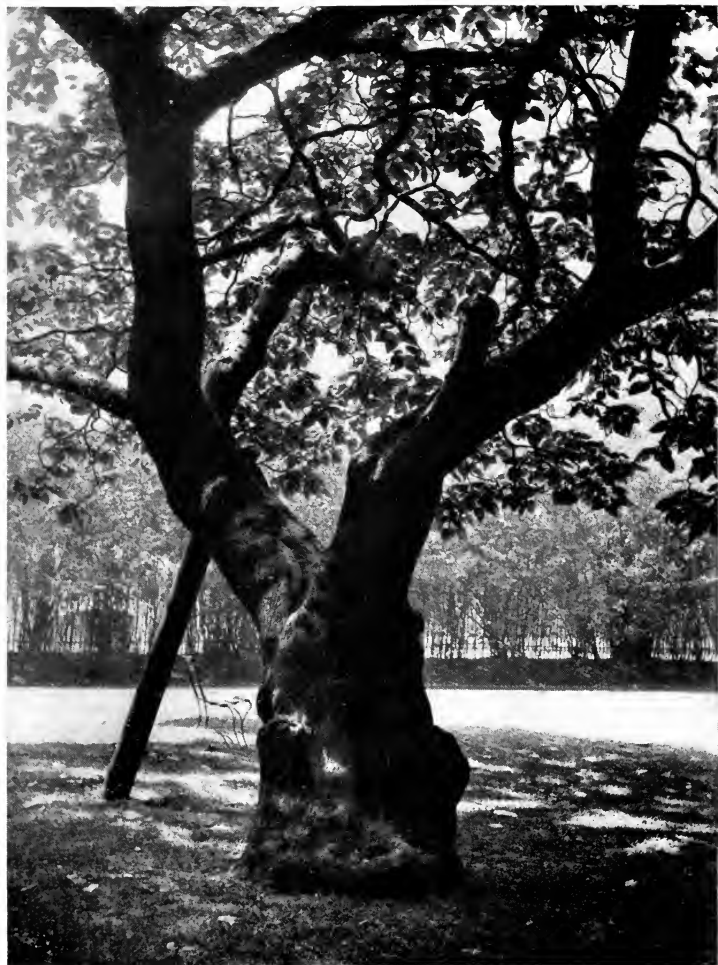
Catalpa in Manchester Square