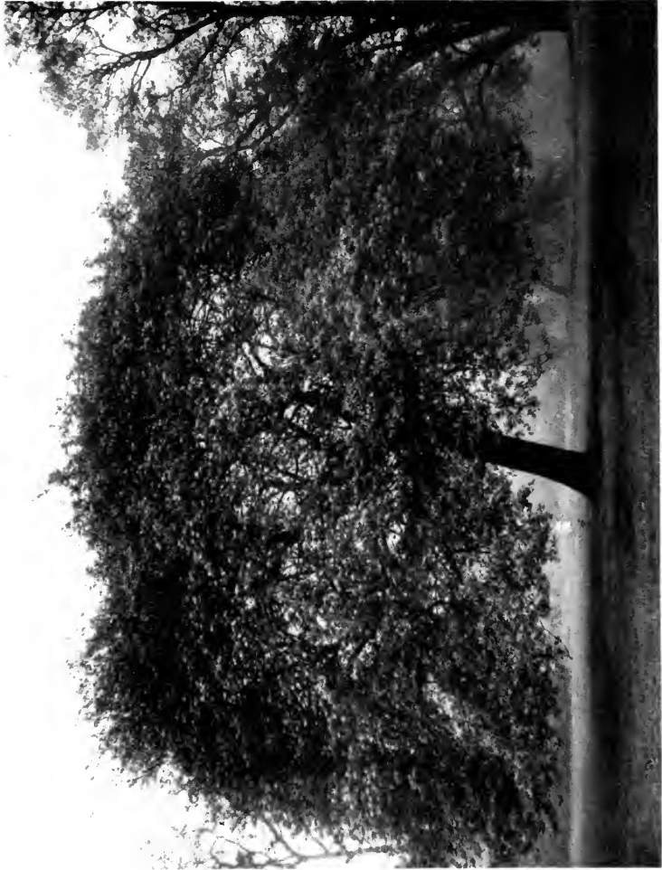
White Beam Tree, Royal Botanic Gardens