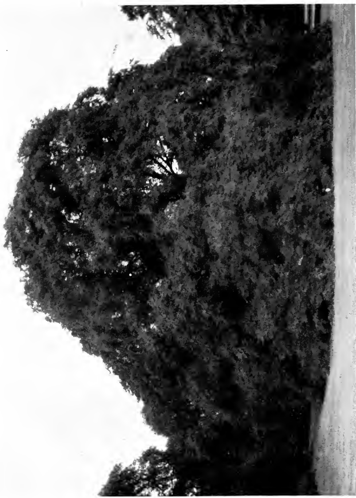
Elm in Flower Garden, Regent's Park