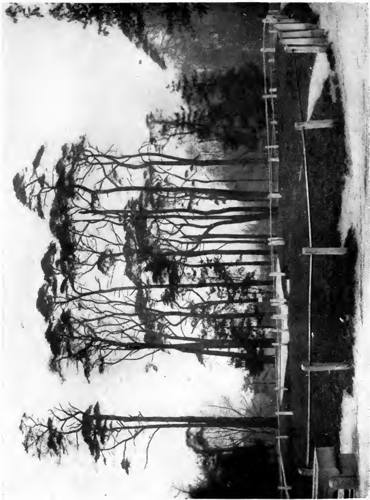
Turner's Firs on Hampstead Heath