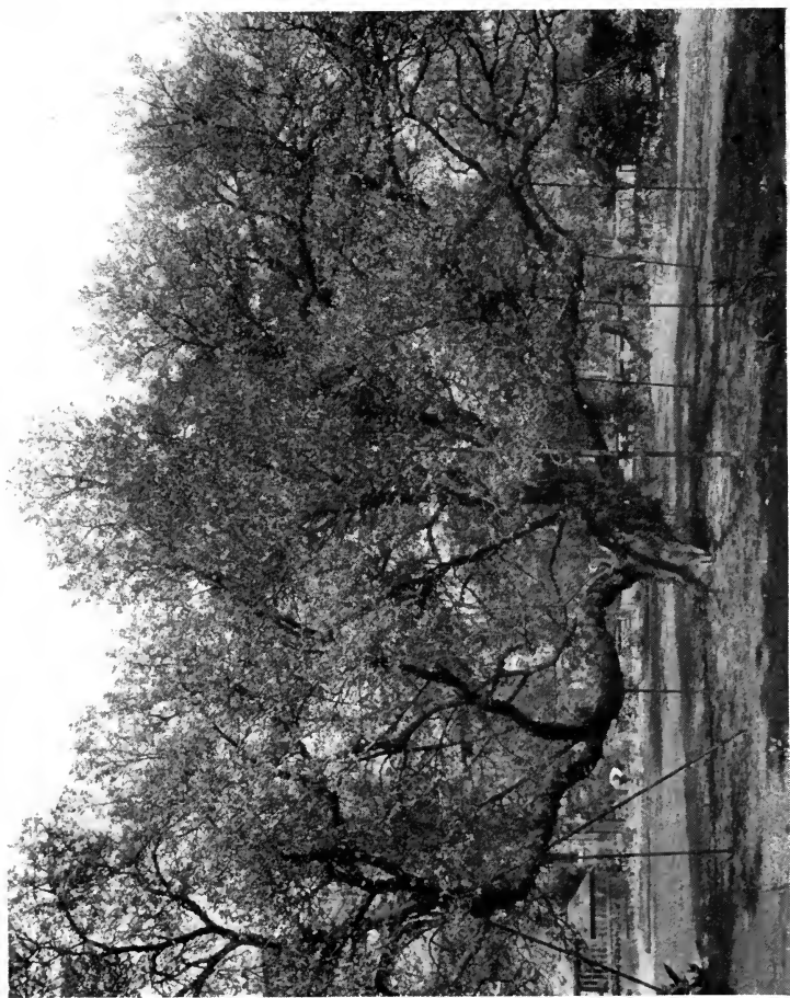
Mulberry at Mildway Park