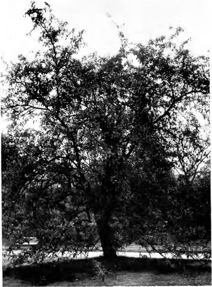
Cotoneaster frigida in Regent's Park