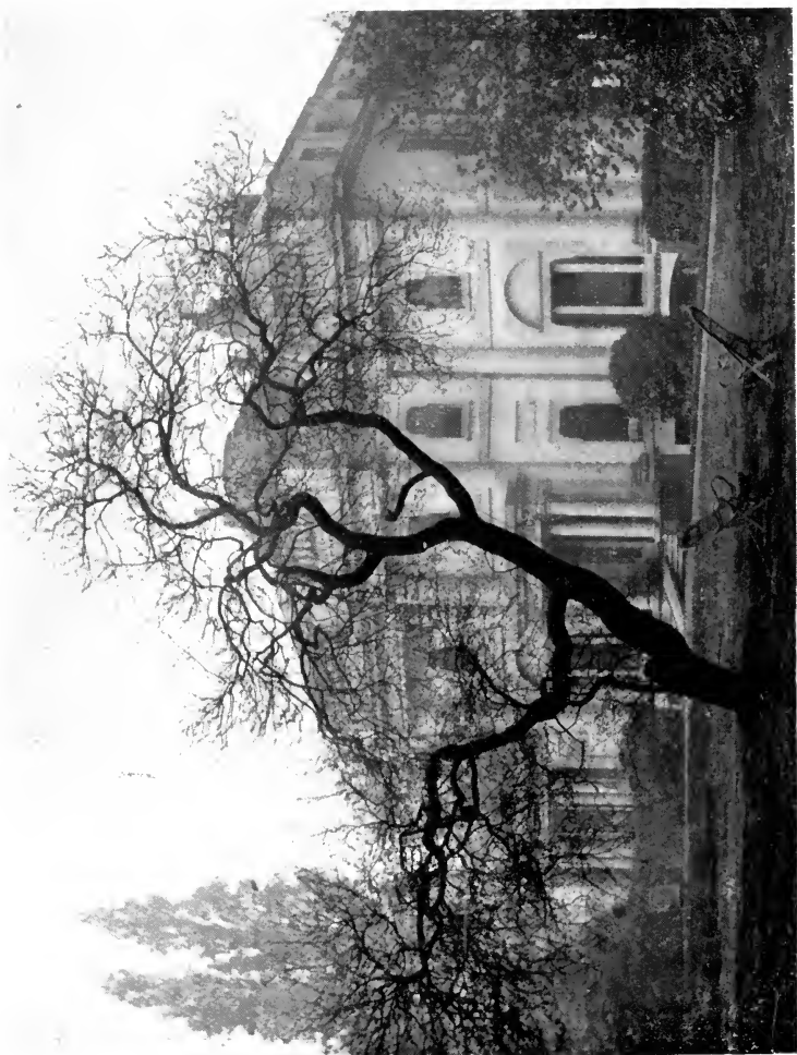
Judas Tree at Wimbledon