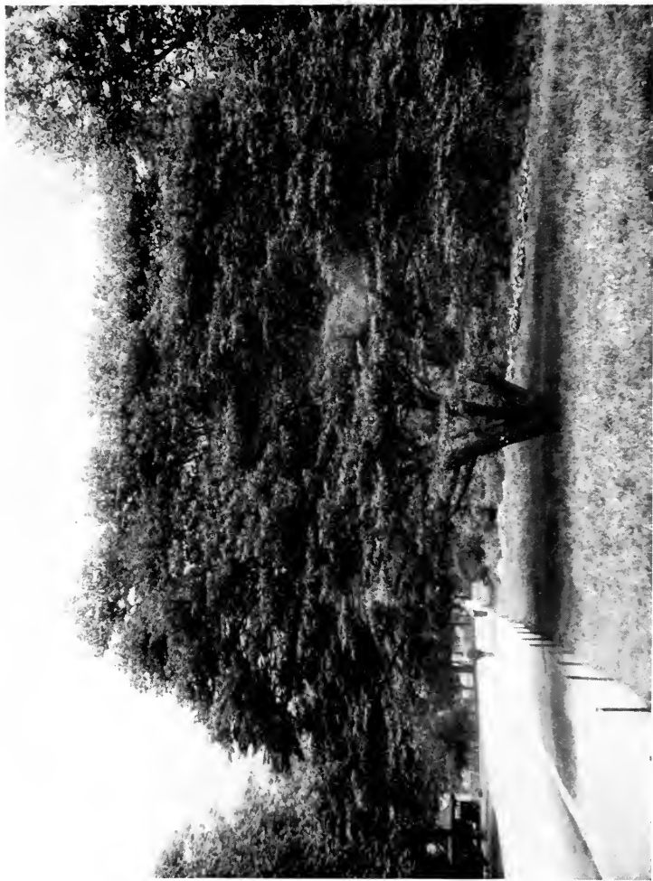
Hop Hornbeam in Battersea Park