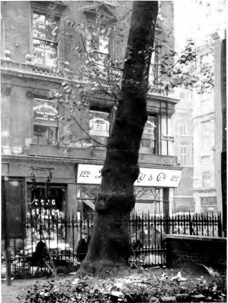
Wood Street Plane Tree