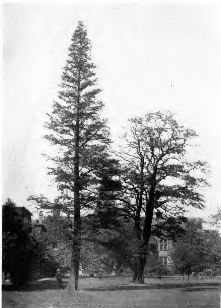
Deciduous Cypress and Acacia at Dulwich