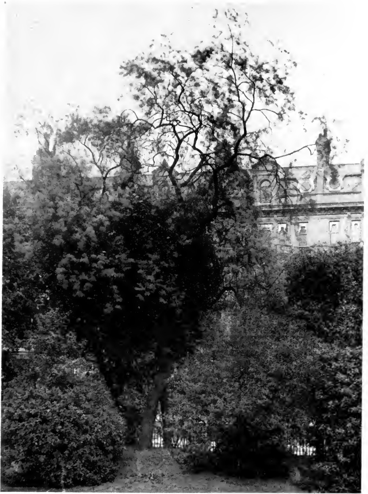
Sea Buckthorn, Regent's Park