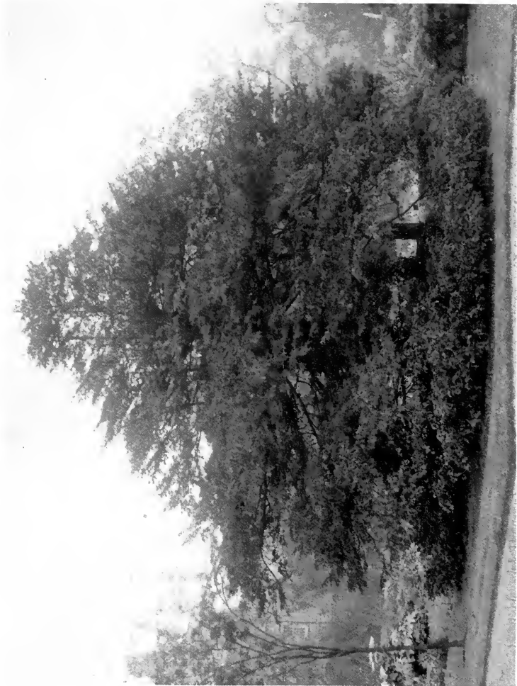
Yew at Chelsea