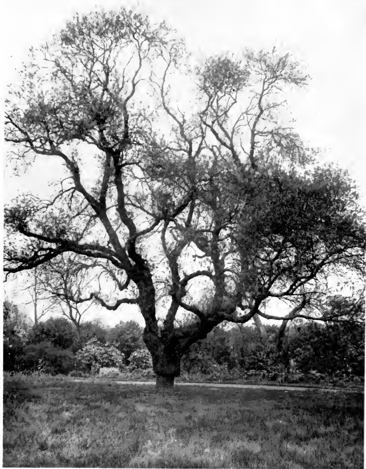
Manna Ash at St. John's Lodge