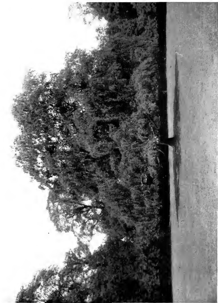
Birch at Belair, Dulwich