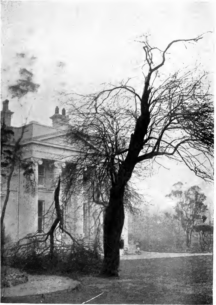
Thorn at Grove House