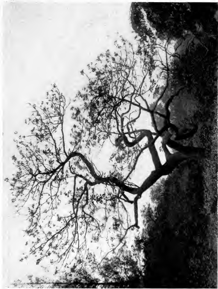
Paulownia imperialis in Regent's Park