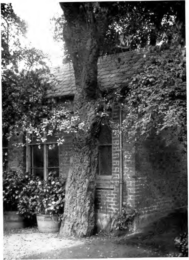
Cork Oak at Belair, Dulwich