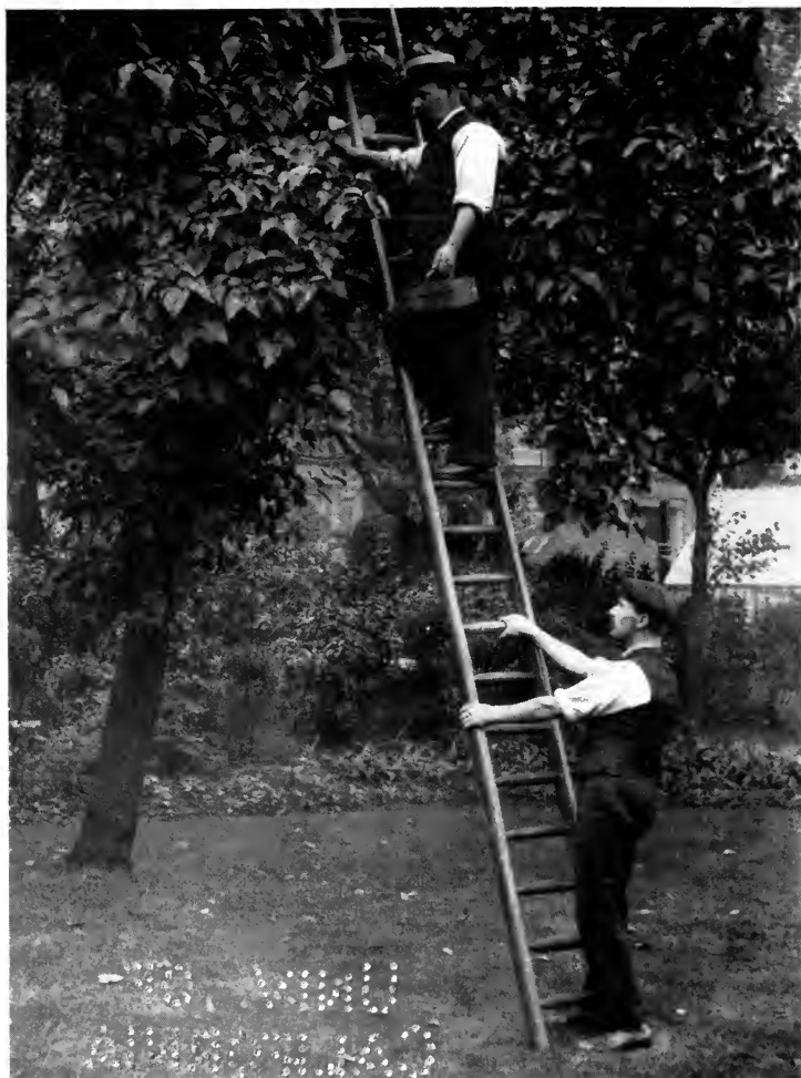
Mulberry Gathering, Finsbury Circus