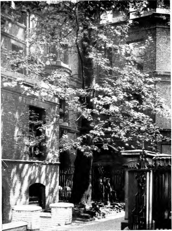
Plane Tree at Stationers' Hall