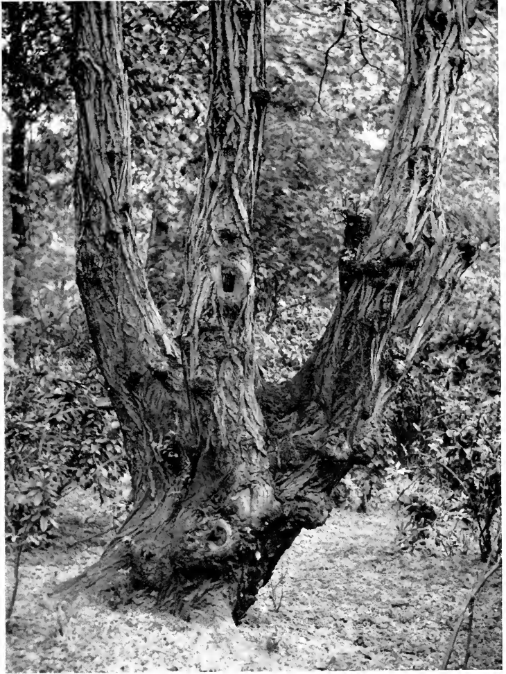
Pterocarya, City of London Cemetery