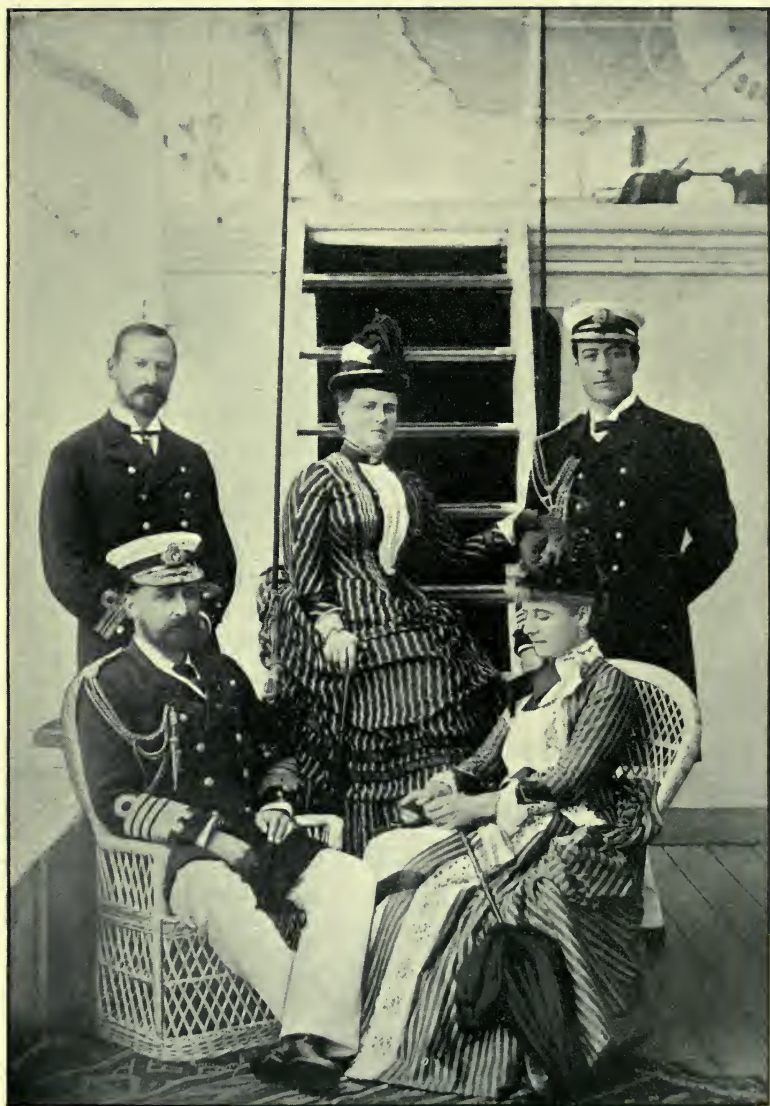
GROUP ON BOARD H.M.S. "SURPRISE"