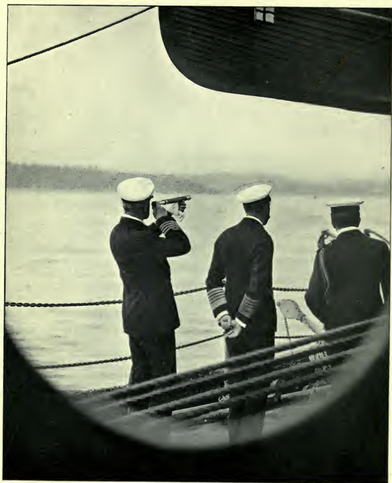
ON BOARD THE FLAGSHIP OF THE HOME FLEET, 1910