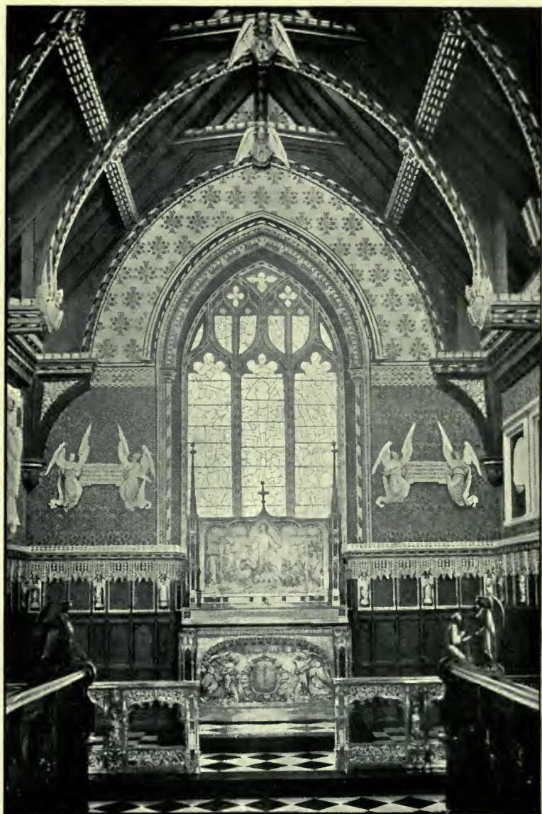
CHANCEL OF SANDRINGHAM CHURCH, DECORATED IN MEMORY OF H.M. KING EDWARD VII