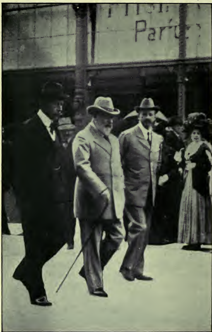
KING EDWARD, WITH EQUERRIES IN ATTENDANCE, ON THE PROMENADE AT MARIENBAD