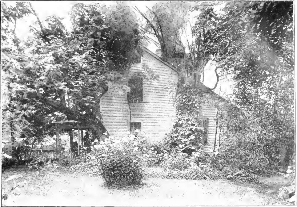
GARDEN AT ANCESTRAL HOME OF THE LOOMIS FAMILY OF AMERICA AT WINDSOR, CONNECTICUT