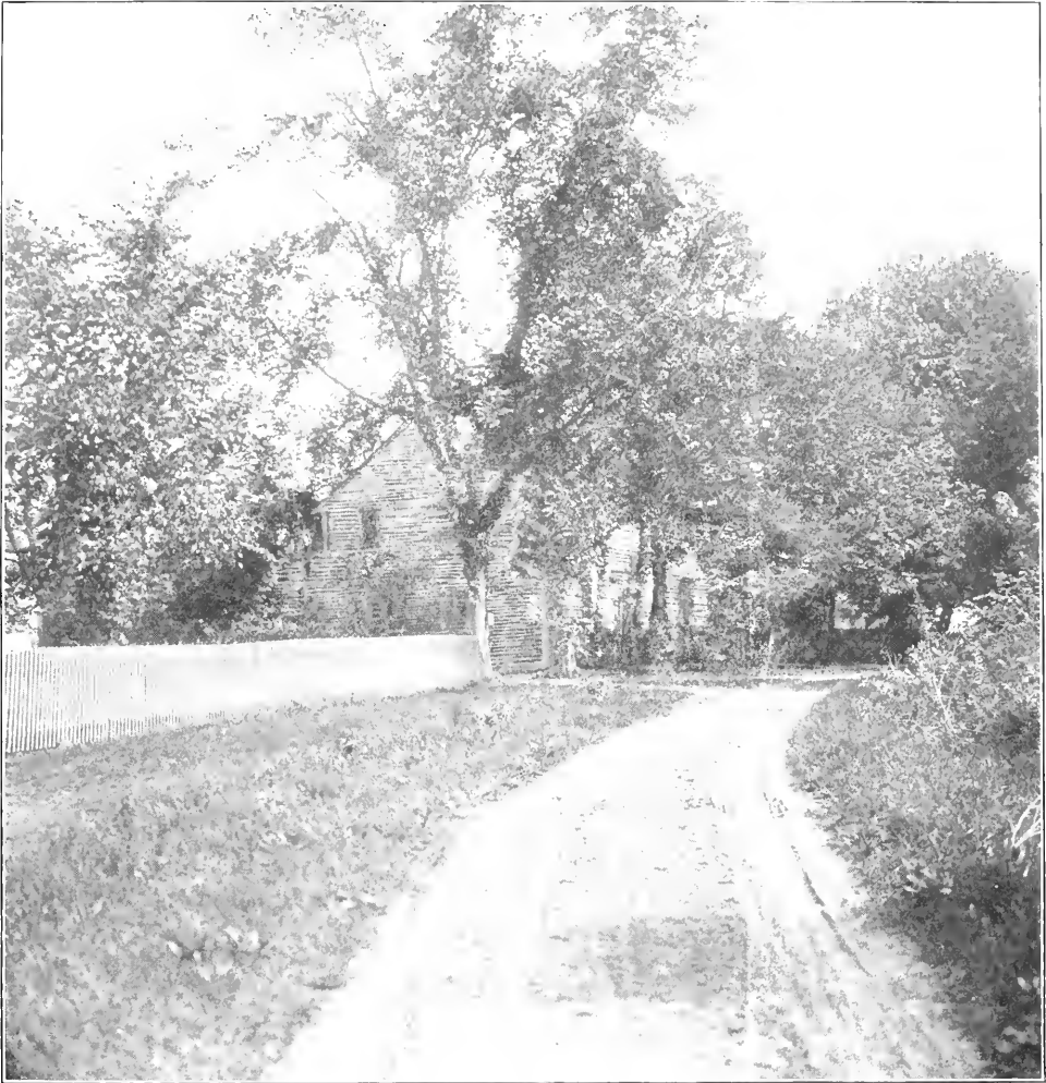
ANCESTRAL HOME OF THE LOOMIS FAMILY OF AMERICA BUILT IN 1749 AT WINDSOR, CONNECTICUT OLDEST HOMESTEAD IN AMERICA IN PERPETUAL POSSESSION OF DESCENDANTS OF ITS PIONEER BUILDERS