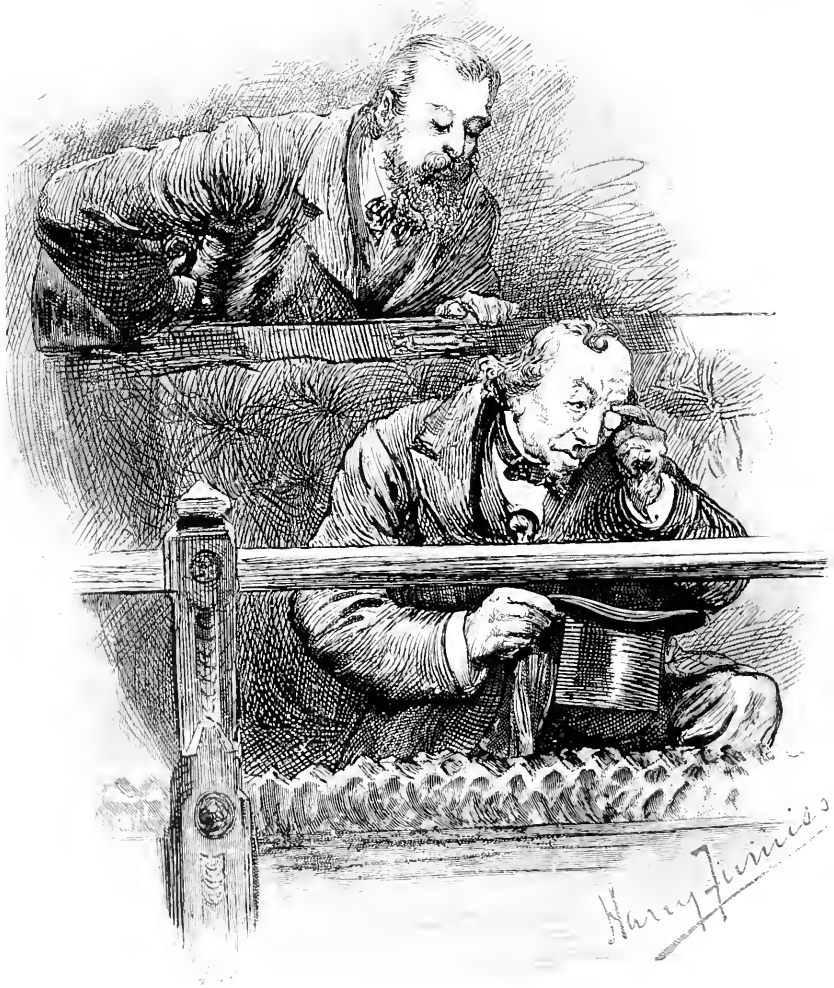
LORD BEACONSFIELD'S LAST VISIT TO THE HOUSE.