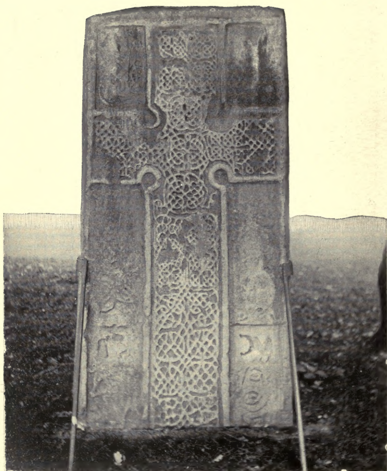
Brodie Sculptured Stone.