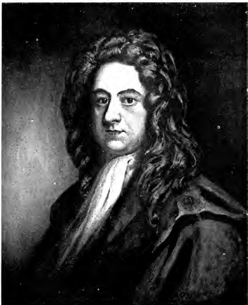
GEORGE GORDON First Earl of Aberdeen