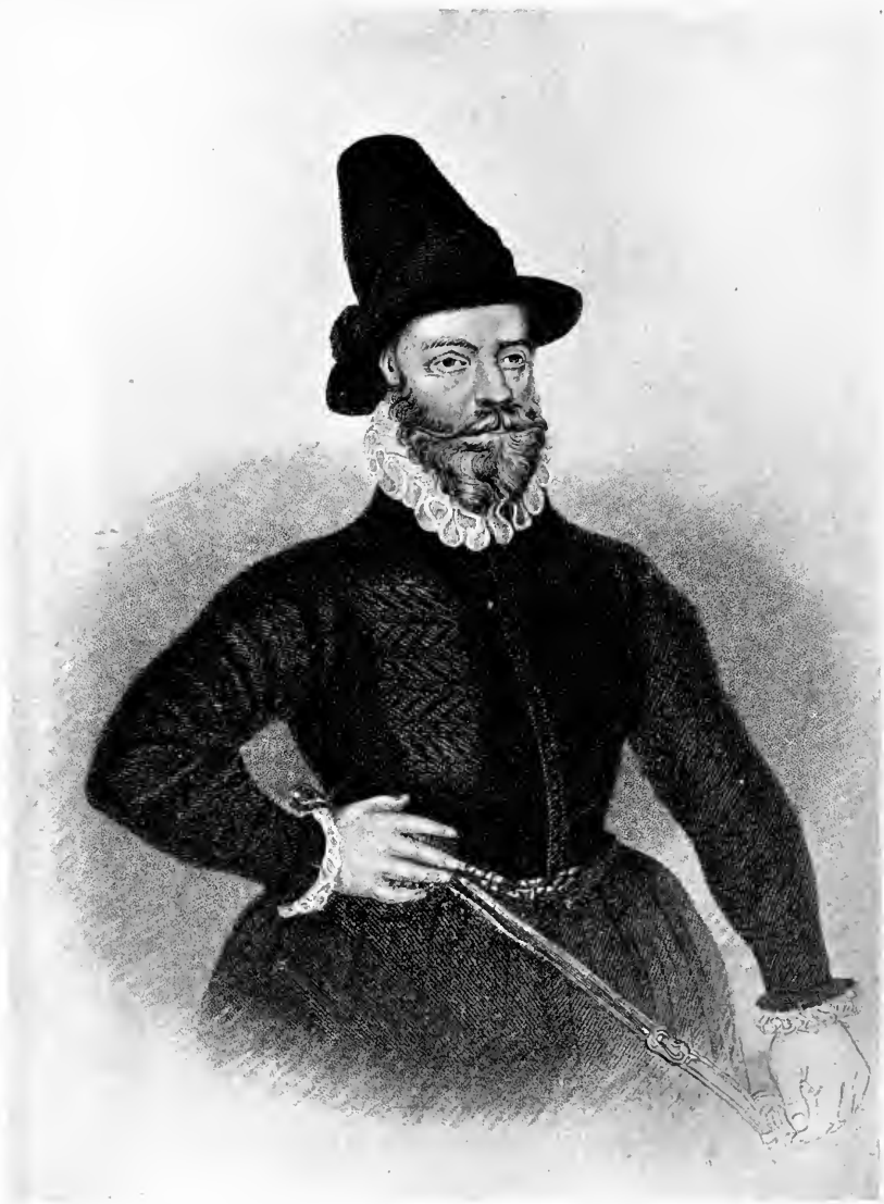
JAMES DOUGLAS Fourth Earl of Morton