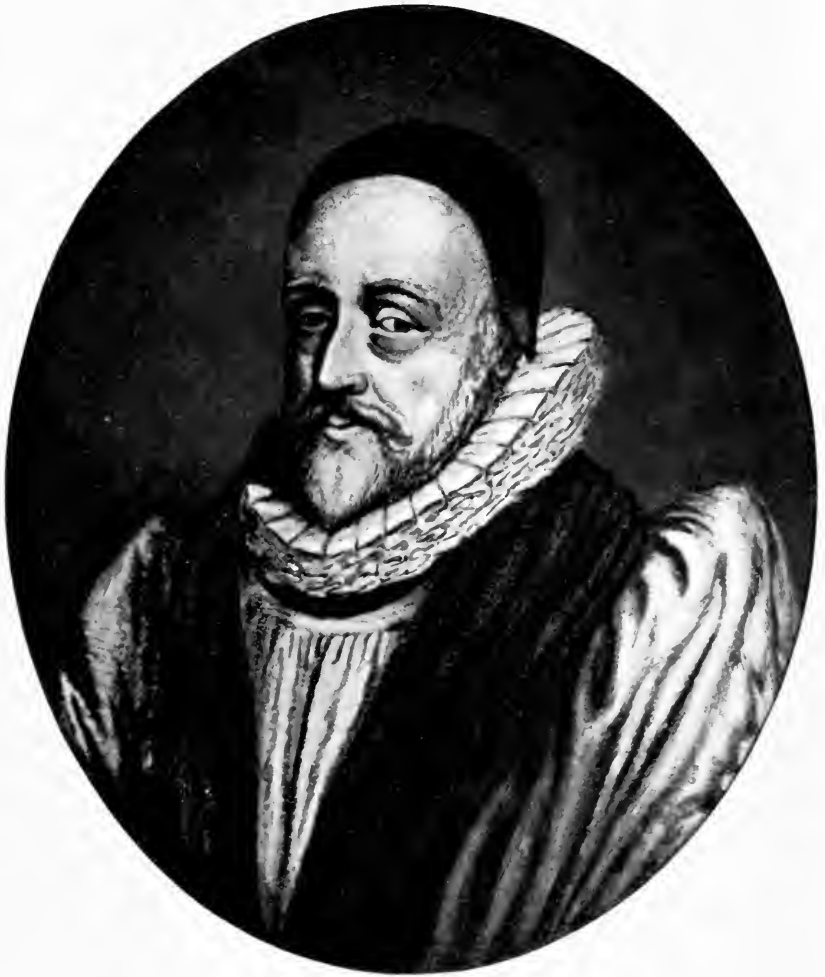
JOHN SPOTTISWOODE Archbishop of St. Andrews