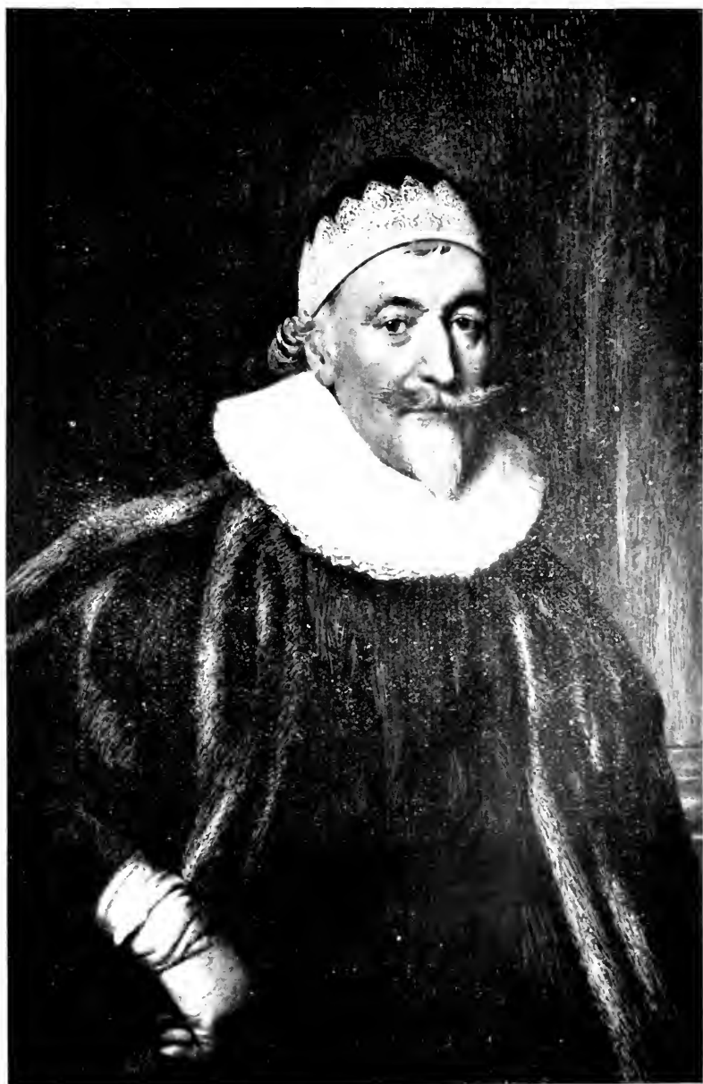
GEORGE HAY 1st Earl of Kintyre