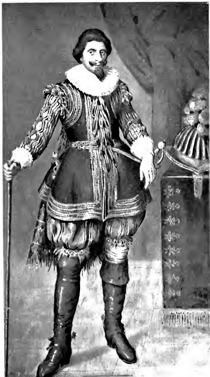
COLIN CAMPBELL, Sixth Earl of Argyll