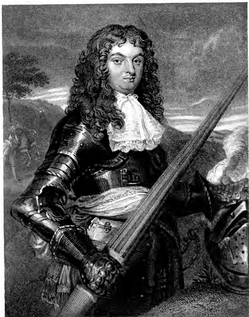
JOHN LESLIE Seventh Earl and First Duke of Rothes