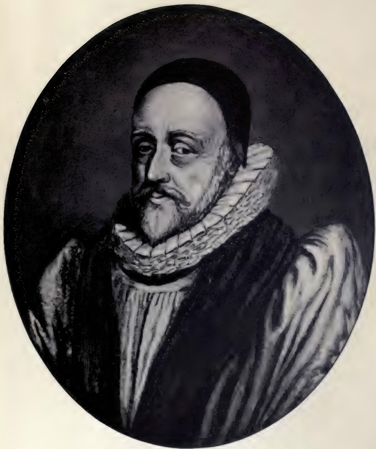
JOHN SPOTTISWOODE Archbishop of St. Andrews