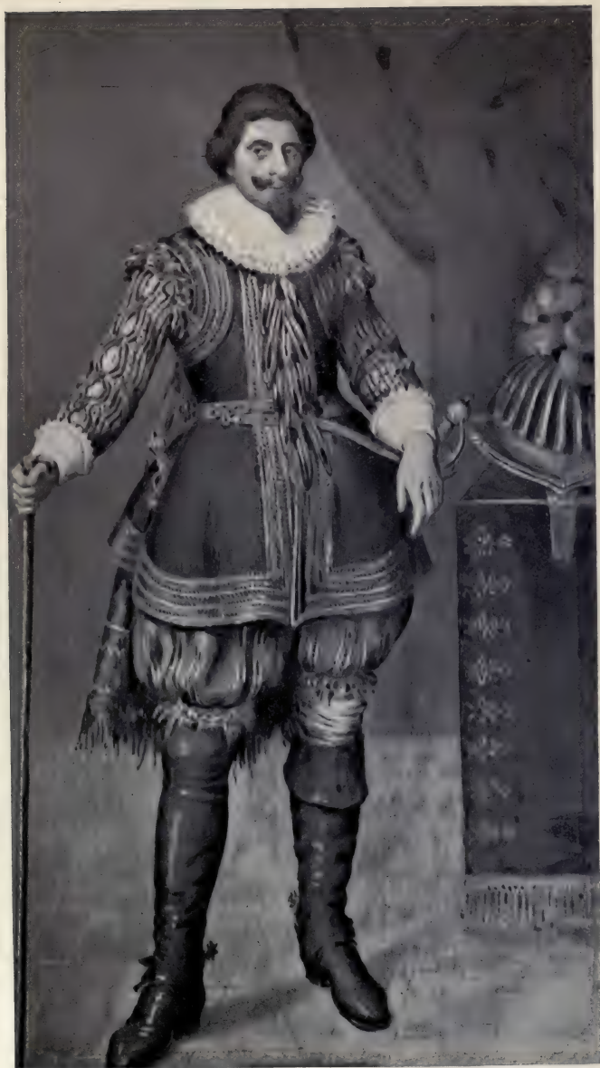
COLIN CAMPBELL Sixth Earl of Argyll