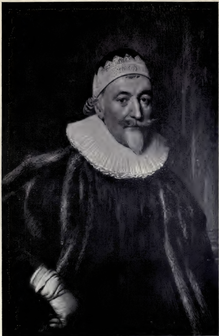
GEORGE HAY First Earl of Kinnoull