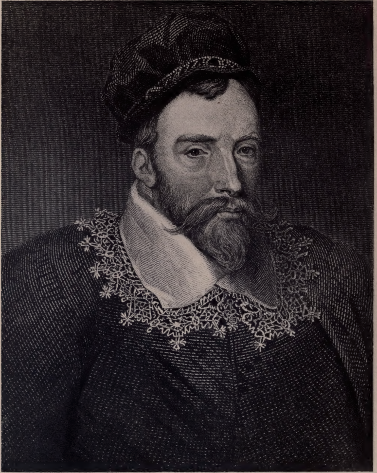
John Maitland, Lord Thirlstane