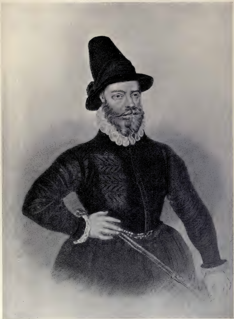
JAMES DOUGLAS Fourth Earl of Morton