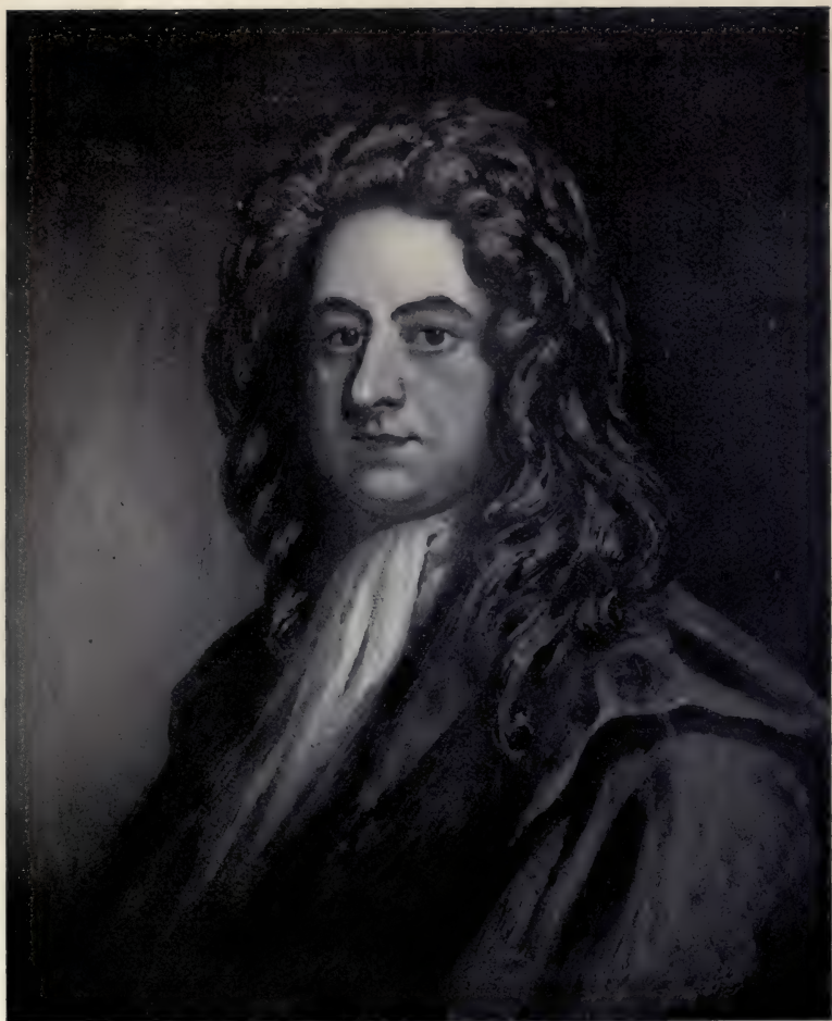
GEORGE GORDON First Earl of Aberdeen